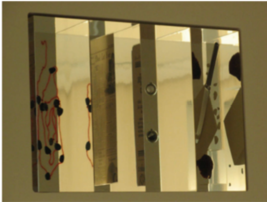
Figure 4. The Glass Library (detail) glass, acrylic, miscellaneous objects

development I was then employed independently by Gallaghers, the main developers, as arts consultant and also to work as part of the design team. This was a completely new and exciting experience. I had been given the opportunity within the main development to infuse some of my research findings into the fabric of the structures. The credit crunch obviously seriously impacted this development, the people and the place. Gallaghers were tied to the Section 106 agreement which brought with it an obligation to ensure all the art projects were realised. This included the commissioning of a community artist who worked directly with house owners as they moved into the development. My link with Cambridge has