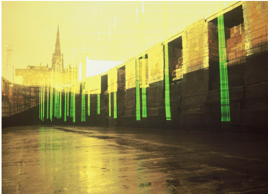
Figure 3. Phosphorescent levels-fluorescent light sticks, plastic tubing, rope

casts of burly shipwrights. It was during this residency that I learnt the many skills needed to arrive at positive communication based on negotiation, trust, good relationships and a feeling of teamwork amongst the shipyard workers realise my research aims (see Mackinnon-Day 2008).