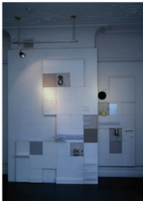
Figure 2. Misty Blue - assemblage: asylum seekers kitchen starter pack

This project was commissioned in Glasgow by the Gallery of Modern Art. High Riser consisted of four pieces of art that questioned the government's approach to asylum seekers being housed in Sighthill high rise flats in Glasgow and the depersonalisation of the individuals involved (Ratcliffe 2004). When I was working on the High Riser project my research aim was to investigate the refugees' personal histories to dispel the myth of the asylum seeker as a parasite who comes to Britain to exploit its benefit system. Paris Green and Misty Blue (see Figure 2) were deconstructions of the mass-produced, cheap as possible 'starter kits' of goods issued to asylum seekers on arrival in Sighthill. Indelible consisted of 76 MDF panels with the hand-written name and occupation of an individual on each one. The layout mimics the grid structure of the tower block, making reference to the failed architectural grid and modular system designed by Le Corbusier to solve the housing shortage in cities. The laser-printed text was illuminated with UV lighting to emphasise the individuals: teachers, doctors, shopworkers, grocers and so on from Iraq, Afghanistan,