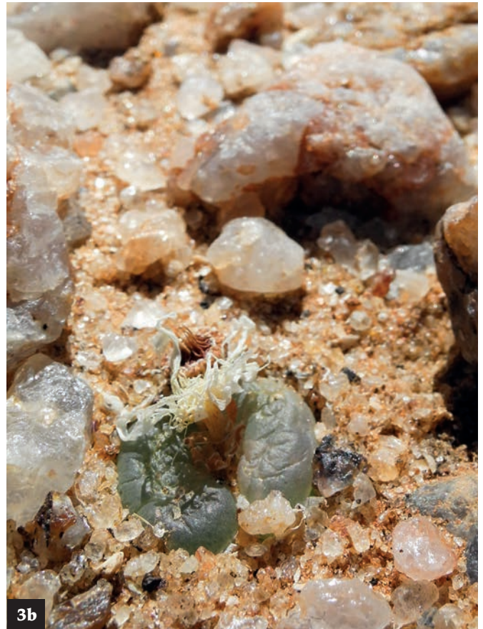
Figure 3a–c. Some Conophytum taxa succeed among small quartz stones on open vlaktes which provide a stable growing environment. The tightly packed white quartzite provides cooling shelter from intense summer heat by reflecting strong sunlight. It also gives protection and sustenance by trapping available moisture and filtering light to allow seeds to germinate and seedlings to survive. Many of the species in these areas are subterranean, retreating sub-surface during the summer. (a) C. calculus ssp. calculus with its pale, highly fused leaf pairs in the Knersvlakte. (b) C. ratum at the Gamsberg (a quartz inselberg in Bushmanland that is currently being mined). This species is mostly buried with only the windowed upper part visible (approx. 1cm diameter) above ground (c, back cover) C. subterraneum near Eksteenfontein in the Richtersveld.