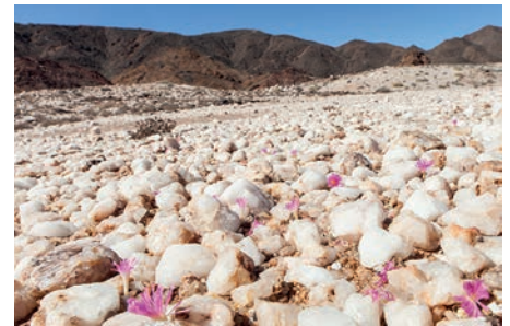
Back cover: C. subterraneum near Eksteenfontein in the Richtersveld.