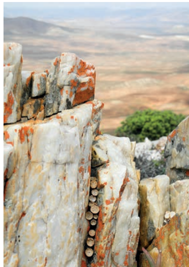
Front cover: C. bachelorum on quartzite blocks on a hilltop southwest of Steinkopf.

Designed by: Homestead Graphic Art Studio. Printed by: Business Print Centre.