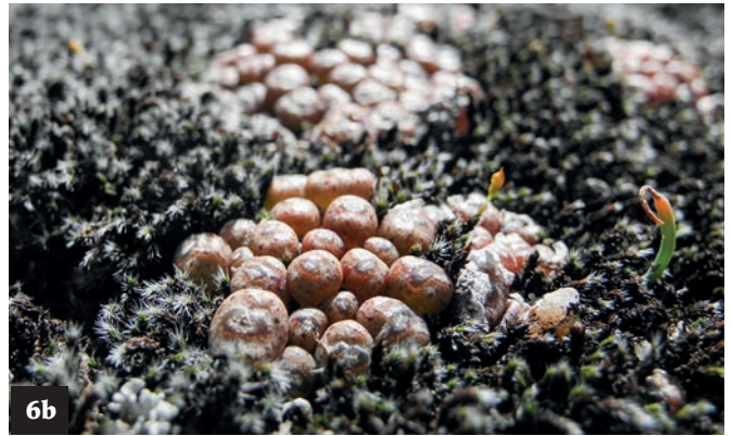
Figure 6a–c. Weathered sandstone is another favoured habitat for many species in the genus. Many Conophytum taxa thrive on the Bokkeveld and Cederberg sandstones where they inhabit shallow sandy pans and lichen and moss-covered rocks. The edges of the high sandstone plateaus and escarpments such as the Matsikammaberg benefit from regular moisture provided by low clouds and fogs, sustaining many miniature succulents including Conophytum . Sometimes the plants will inhabit only the shallow fringes of a large and deeper pan and just like the pans on granite domes, sandstone pans must be level and just the correct depth for conophytums to make use of them. Many pans may look just right but if the depth is too little or too great or there is any incline they are generally devoid of such plants. (a) C. minusculum ssp. minusculum 'paucilineatum' in a weathered sandstone 'pocket' among rooibos plantations south of Clanwilliam. (b) C. minusculum ssp. minusculum finds the protection of thick, dark moss to provide the ideal environment on the north-eastern end of Matsikammaberg. (c) C. obcordellum ssp. obcordellum 'ursprungianum' in a shallow sandstone grit pan south of Nieuwoudtville.