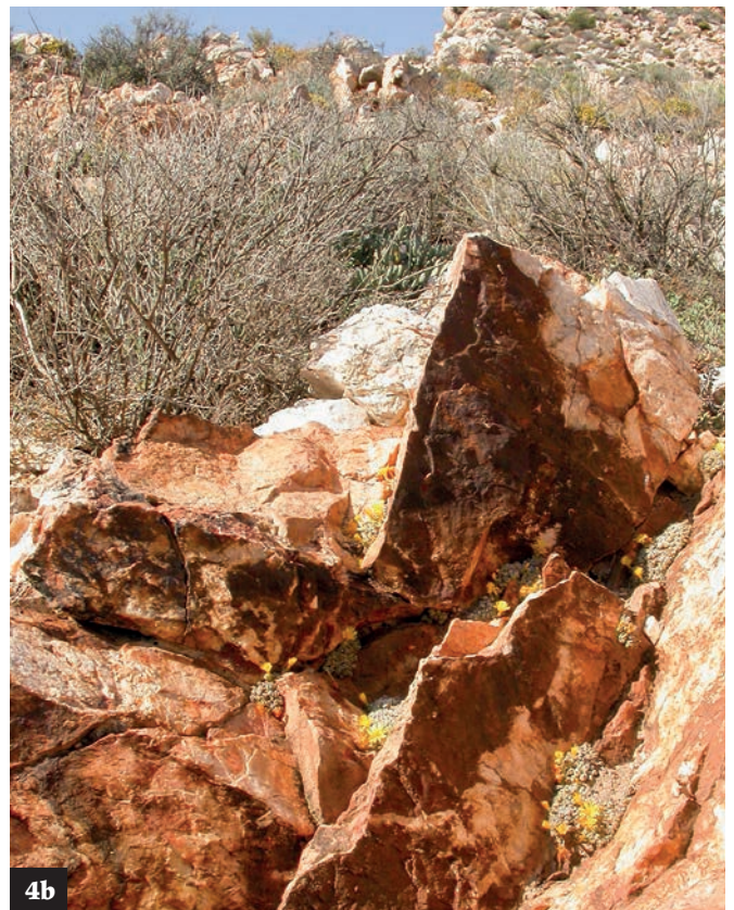
Figure 4a–c. The very tops of quartzite hills and mountains also provide many Conophytum with the moisture they benefit from as a result of frequent exposure to fogs and low clouds browsing the peaks. Some species prefer the gravels which accumulate on the flatter areas on top of these peaks, but most prefer to occupy the smallest of cracks and fissures in large rocks and boulders where they do remarkably well in these seemingly nutrient-free places. Invariably restricted to the south and southwest shadier sides of hills, seeds lodge and germinate in such niches deep inside these cracks and again, the stability of their micro-habitat appears to be a key factor in their success. (a) C. stephanii ssp. helmutii inhabiting vertical cliffs on the massive Rosyntjieberg in the Richtersveld. (b) C. tantillum ssp. amicorum at its only known locality on a small quartzite hill north of Springbok. (c, front cover) C. bachelorum on quartzite blocks on a hilltop southwest of Steinkopf.