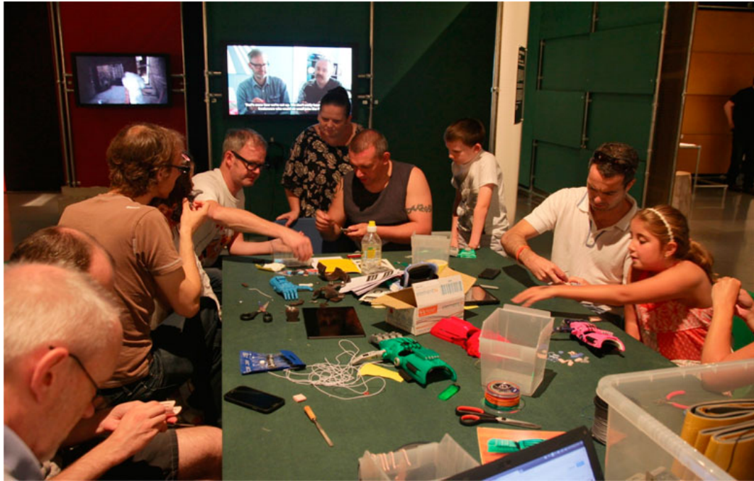
Figure 2. Desktop Prosthetics—a workshop in the gallery at FACT during 'Build your Own'. Members of the public 3D print, assemble and fit prosthetics with their children.

we simply help our community to realise their projects with the facilities we have. Our community is essentially anyone who wants to do something with us.