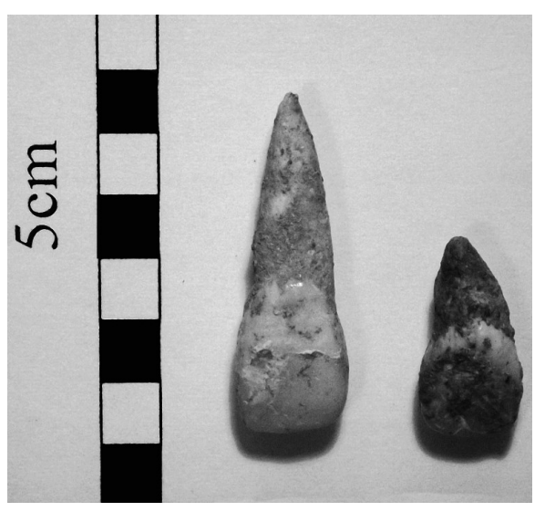
Fig. 2. UI1 presenting average sized root (left) and another displaying HRUCI (right), both from Cerro de las Baterías, Spain.

Population (Ando et al., 1967; Jakobsson and Lind, 1973; Thongudomporn and Freer, 1998), family (Apajalahti et al., 1999) and longitudinal studies (Ando et.al, 1967; Hölta et al., 2004) indicate that short roots in UI1 is a genetically controlled feature (Brezniak and Wasserstein (2002a) state that root resorption is "an unavoidable consequence of orthodontic tooth movement."). It is more frequent in females than males at a ratio of 2.7:1 (Jakobsson and Lind, 1973; Thongudomporn and Freer, 1998); moreover, there are differences in frequencies among populations (Table 1), and it may have an autosomal dominant pattern of transmission (Apajalahti et al., 1999). In cases where resorption is not considered the cause, shortened roots are bilaterally expressed (Jakobsson and Lind, 1973; Margues et al., 2010). However, as far as we know, this trait has not