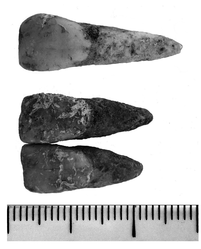
Fig. 4. A pair of compatible UI1 from BT07 displaying HRUCI (below) and a right presenting UI1 regular root length (above).

In all sites except Monte das Covas 3, skeletons were disarticulated. Although all teeth in this study come from fragmented maxillae, the skulls from Monte das Covas 3 were removed en bloc from the field and excavated in the labora-