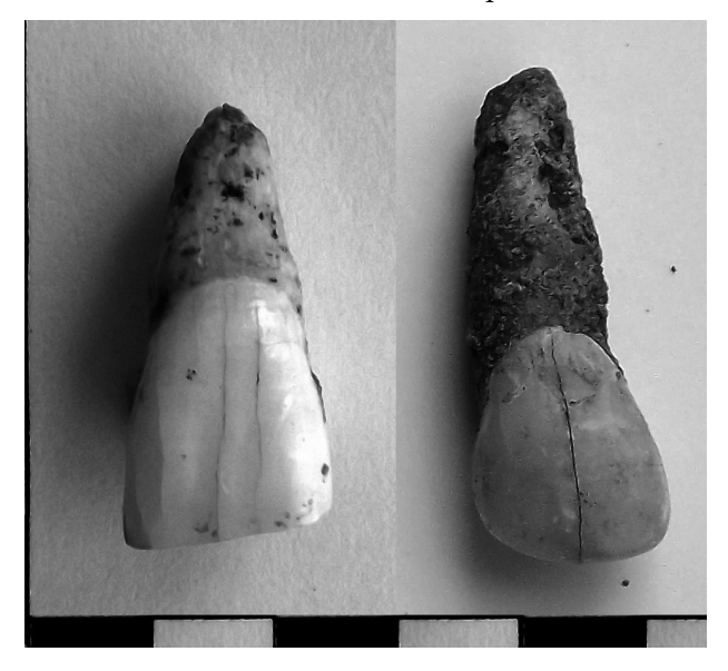
Fig. 5. Smooth root surface on a HRUCI UI1 (right) and irregular surface of a blunt root in a UI2 (left) presenting evidence of hypercementosis.

force resulting in resorption or premature closure of the UI1 radicular apex would have been distributed along the other anterior teeth, particularly in lower incisors to cause shortening of their roots as well. In the sample of Cerro de las Baterías, 158 loose lower incisors (LI1 and LI2) presenting closed apex and intact roots were observed to determine if a similar frequency of shortened roots matched that for UI1. Only three teeth (1.89%) presented apparently short roots, and none of the LI1 and LI2 presented roots