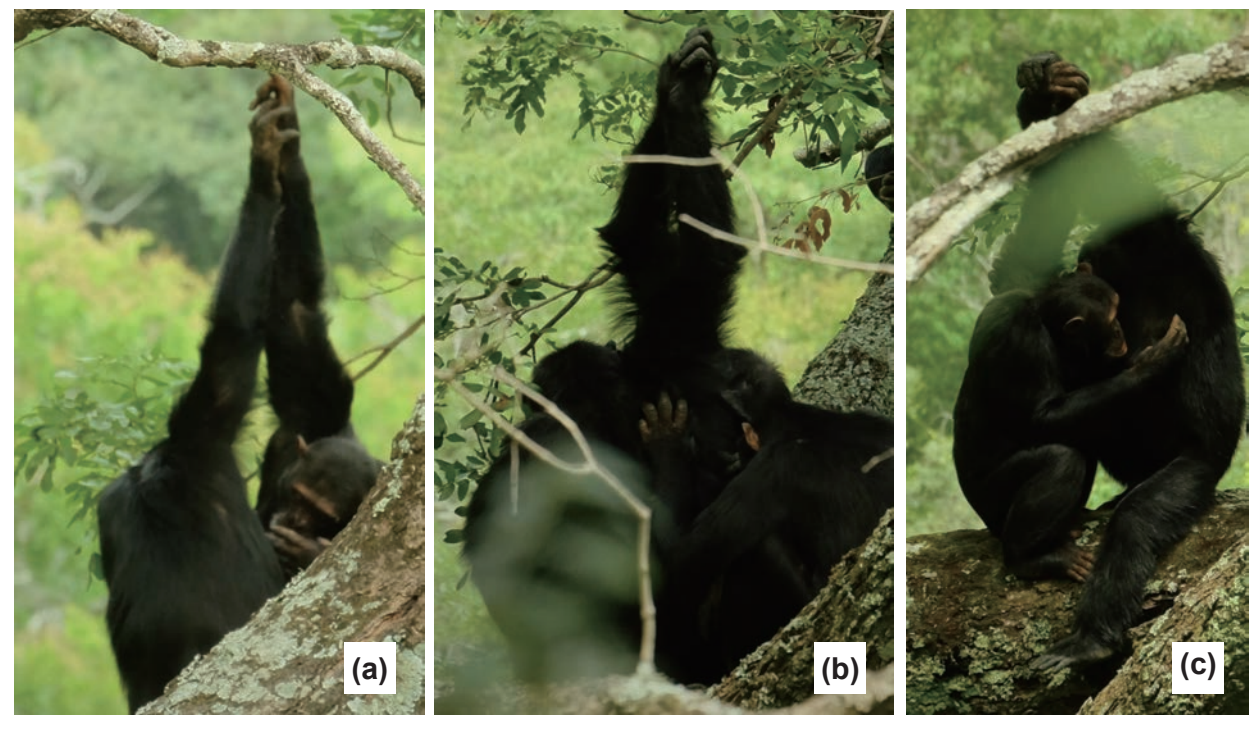
Figure 2. Issa chimpanzees engaged in three types of grooming hand clasp. (a) wrist to palm, (b) palm to palm, and (c) wrist to wrist

with a sexual swelling), and one infant.