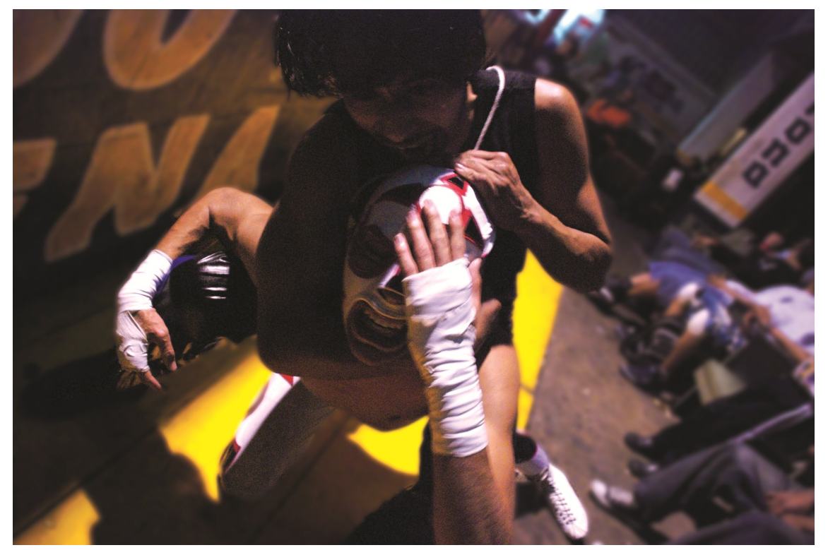
Fig.1 Fight between a Rudo (Black) and a Técnico (White).