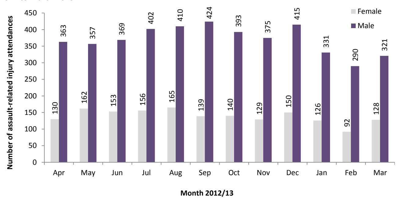
Figure 1: Number of assault-related injury attendances to all Lancashire EDs by month and gender, April 2012 to March 2013