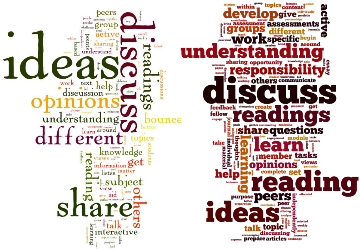
Figure 1(a). Baseline Wordle – question 1 Figure 1(b). Follow-up Wordle – question 1