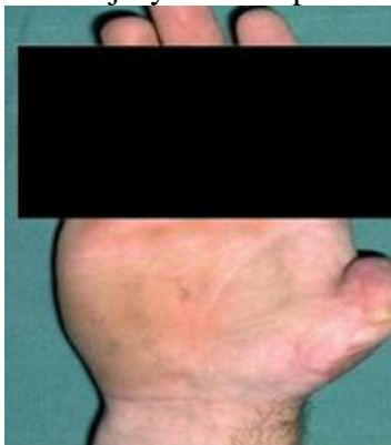
Mild injury-themed poster