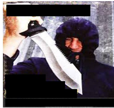
(aggressive) Masculinity poster