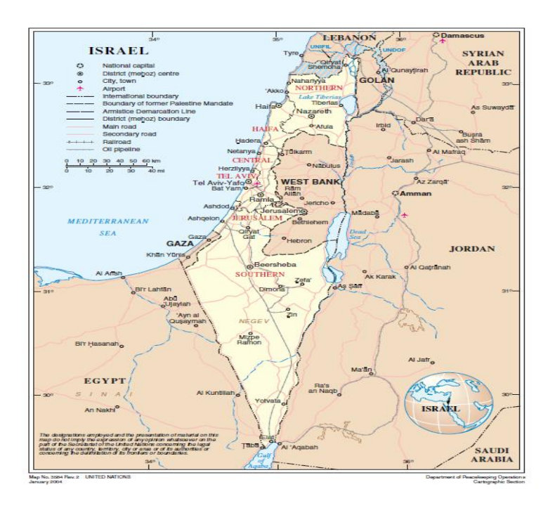
Map of the State of Palestine

The State of Palestine consists of the non-contiguous West Bank including East Jerusalem and the Gaza Strip with a densely packed population. Its unique socioeconomic context is characterized by political and economic tensions, and has created conditions that facilitate the spread of illicit drug use among Palestinians, particularly among youth, women and family members of current drug users. The use, trafficking and selling of drugs is a growing problem, creating an array of social, psychological, health, economic and political problems for Palestinians. Drugs include marijuana, prescription medications (anti-depressants, Z-hypnotics, benzodiazepines and analgesics), and novel psychoactive substances (NPS) ('sintetique marijuana'), with reported high dose use of methadone, morphine, phencyclidine, barbiturates, benzodiazepines, synthetic opioids such as Tramadol, and GABA drugs such as pregabalin. There are an estimated 26,500 high-risk drug users (HDU) in