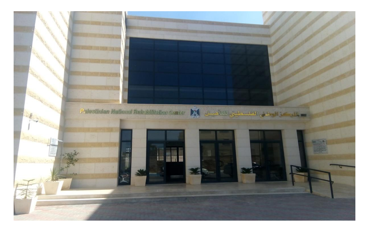
The Palestinian National Rehabilitation Centre