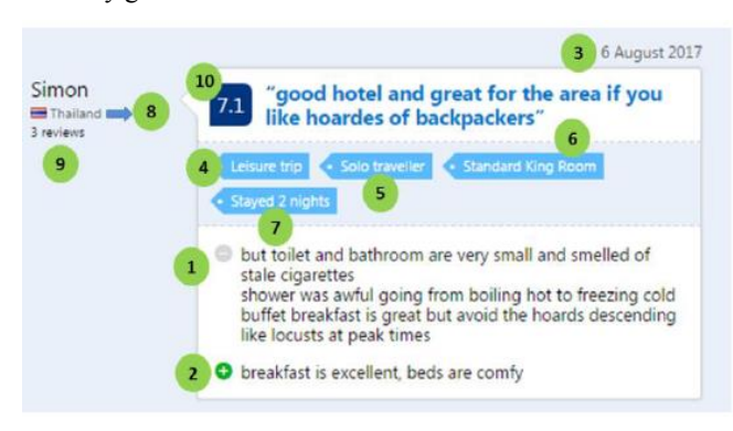
Figure 1. Example of a review on Booking.com

Data are collected from Booking.com. Booking.com, unlike other hotel review websites, allows only customers who have been to the hotel they booked to write reviews, which can prevent deceitful comments from marketing teams and competitors [25]. 47% of reviewers are from Europe, followed by 33% from Asia. Analysing customers' type shows that 52% of the reviewers were couple, 19% solo, 15% group and 12% family with young children, 2% family with older children and 1% people with friends. 97% of reviewers travelled for leisure which is mainly reflect on the location. As shown in Figure 1 below, Booking.com structures reviews into (1) negative and (2) positive sections, and provides information about (3) date of review, (4) trip type, (5) traveller type, (6) room type, (7) number of nights per customer stay in that hotel/hostel, (8) of traveller, (9) number of reviews written by user and (10) rating that they give the accommodation.