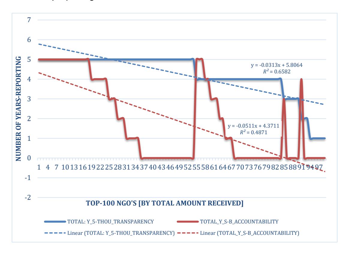
Figure 2. Top-100 NGO's: Number of years reporting on funding received vs. social accountability reporting.

The declining trend between the number of NGOs that reported funding while also evidencing social accountability is highlighted in Figure 2. While 30% of the top recipients of funding demonstrate transparency and social accountability, 44% of NGOs acknowledge receiving funding but fail to demonstrate social accountability.