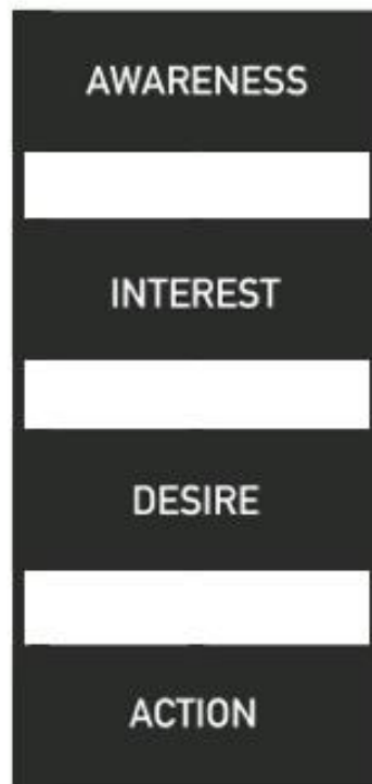
Figure 1 The traditional buyer decision-making model based on the AIDA concept

In the contemporary digital age, the currency of such models would seem questionable (Scott et al, 2015). For instance, to take the above representation, the modern sales and decision-making process is prone to being characterized as ‘Digital Darwinism’, an expression that is thought to have first been coined within the title of a book by Schwartz in 1999. The futurist, Brian Solis (2016), highlights the pandemic nature of Digital Darwinism and its paradoxical levels of obsolescence and growth within technological capabilities. Solis suggests that Digital Darwinism is ‘the phenomenon where technology and society evolve faster than an organization can adapt’ (briansolis.com, 2016). As gaps continue to evolve and emerge in terms of technology, business resources and capabilities, the digital age persists in shifting and adapting consumer behaviour and decision-making process (Scott et al, 2015).