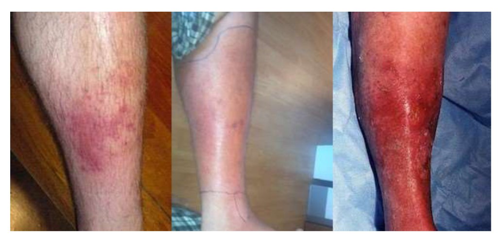
Fig 2. From left to right: Mild, moderate, and severe cellulitis.

The questionnaire was developed through consultation with a panel of experts and drew on existing surveys such as the Unlinked Anonymous Monitoring (UAM) Survey, a National surveillance study with PWID conducted annually [17]. Question domains comprised: sociodemographics; drug use history, injection preparation and administration practices (lifetime and previous 12 months); reuse and cleaning of injecting equipment (lifetime); experience of SSTI and other health conditions and care seeking practices (lifetime). Questions pertaining to SSTI experience were accompanied by pictures of abscesses and/or cellulitis at different stages (Figs 1 and 2). Still-based images are a reliable method for the assessment of wounds, their type and severity [19], with evidence that photographs can illicit clinical evaluations equivalent to those conducted in person [20]. Participants were shown SSTI photographs along with a