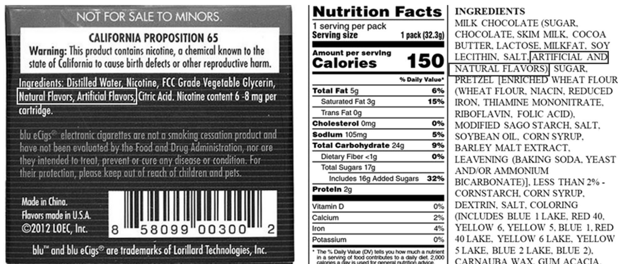
Fig. 1 Back-of-pack ingredients and nutrition labels. Examples of ingredient and nutritional information labelled on blu eCigs ® flavoured e-cigarettes (left) and on a packet of chocolate candies (right) highlighting the information regarding the type and concentration of flavour used in the formulation. The only available information is generally given as “artificial and/or natural flavours”.

efficiently delivered into the lungs, along with the PG and/or VG solvents in which they are dispersed.