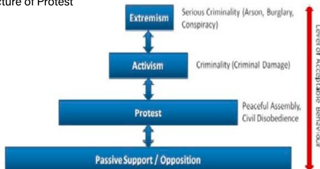
[Fig 1, 'The Structure of Protest', NPCC 2016]