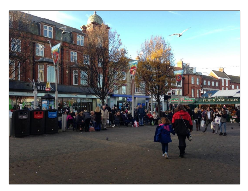
Figure 4. Market Square in Great Yarmouth