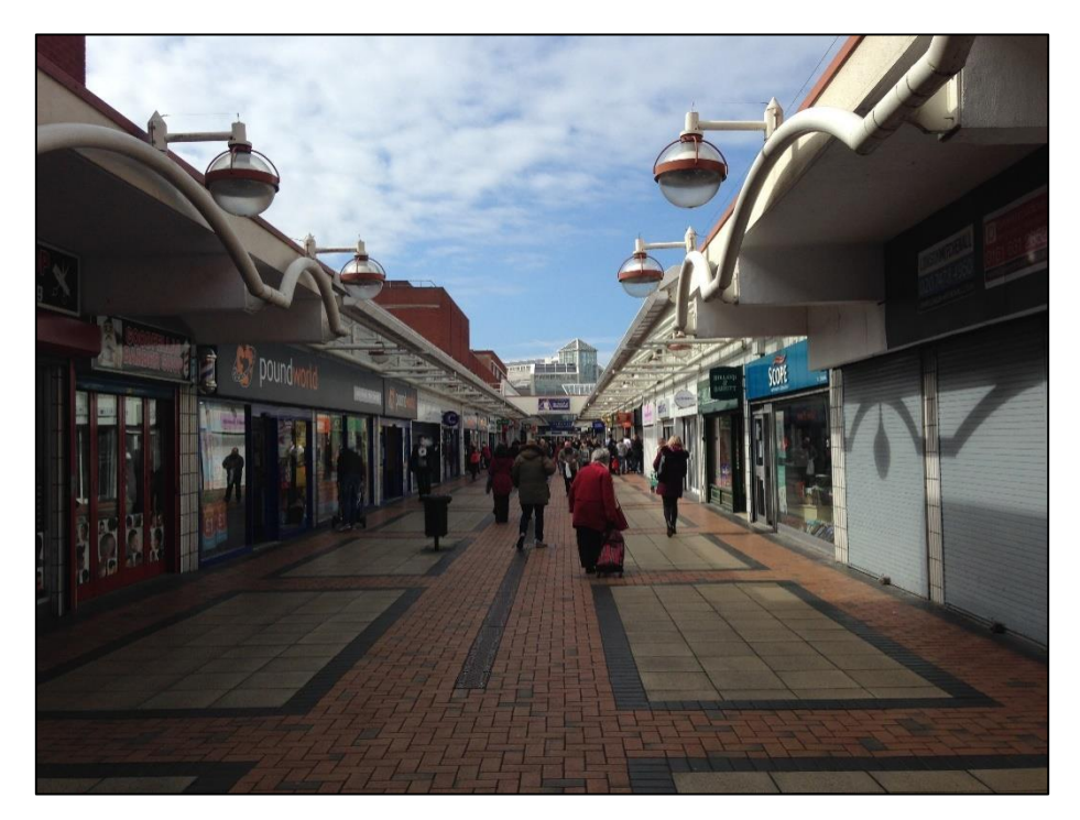
Figure 2. Semi-covered pedestrianised street in Birkenhead (author's own)

Figure 1. Geographical distribution of the towns across England, from which high streets were selected