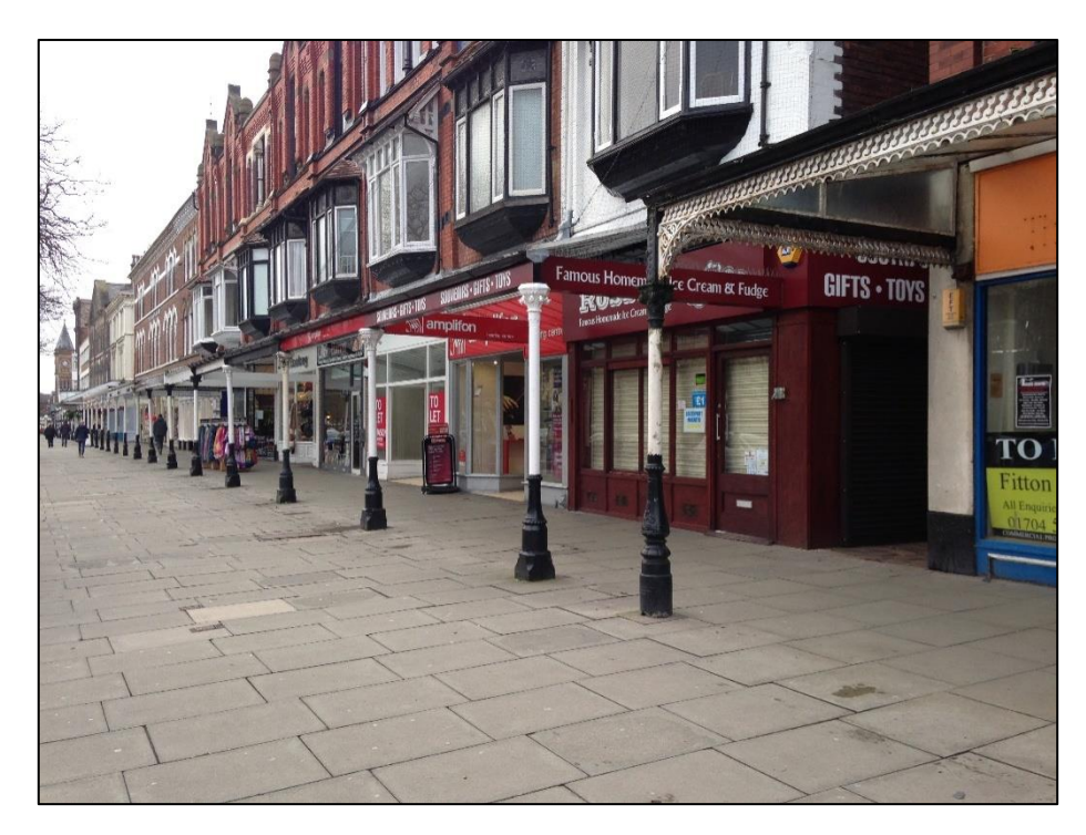
Figure 5. Lord Street, Southport (author's own)