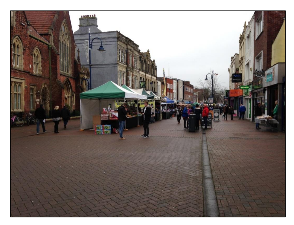
Figure 3. Pedestrianised high street in Gosport