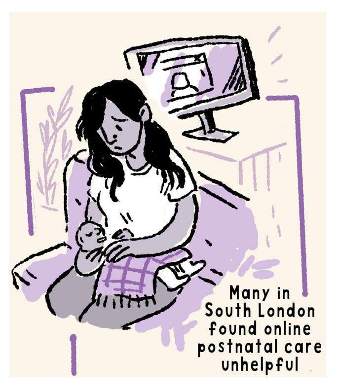
Fig. 2. Artistic depiction of findings - online postnatal care

Many women expressed they had less postnatal care than expected, and often felt mental health care was lacking: