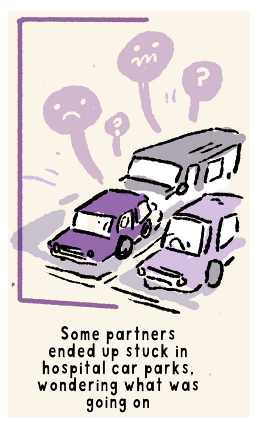
Fig. 3. Artistic depiction of findings – birth partners

However, restrictions were often viewed as arbitrary and, therefore, changes to birth plans, including presence of birth partners, were frequently reported as unnecessarily frustrating: