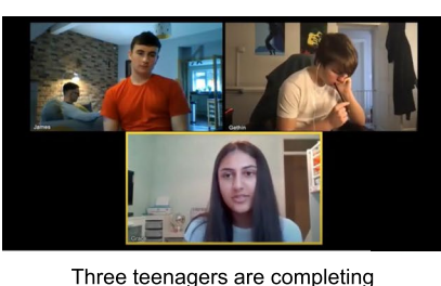
Three teenagers are completing schoolwork using online video conferencing.

Ford et al. BMC Public Health (2022) 22:583 Page 3 of 14