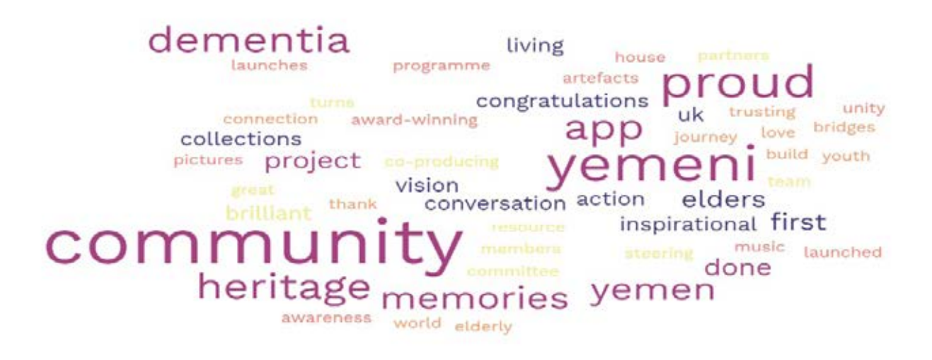
Figure 2 – Twitter word cloud (Memories of Yemen app launch June 2022)

Figure 1 – Twitter word cloud (project launch February 2021)