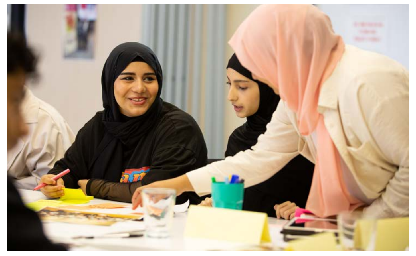
House of Memories - Connecting with Yemeni Elders Heritage

The project has provided a meaningful platform therefore for the personal development of young people, through opportunities to participate in the delivery of the project itself and through additional opportunities that have emerged via wider professional networks within