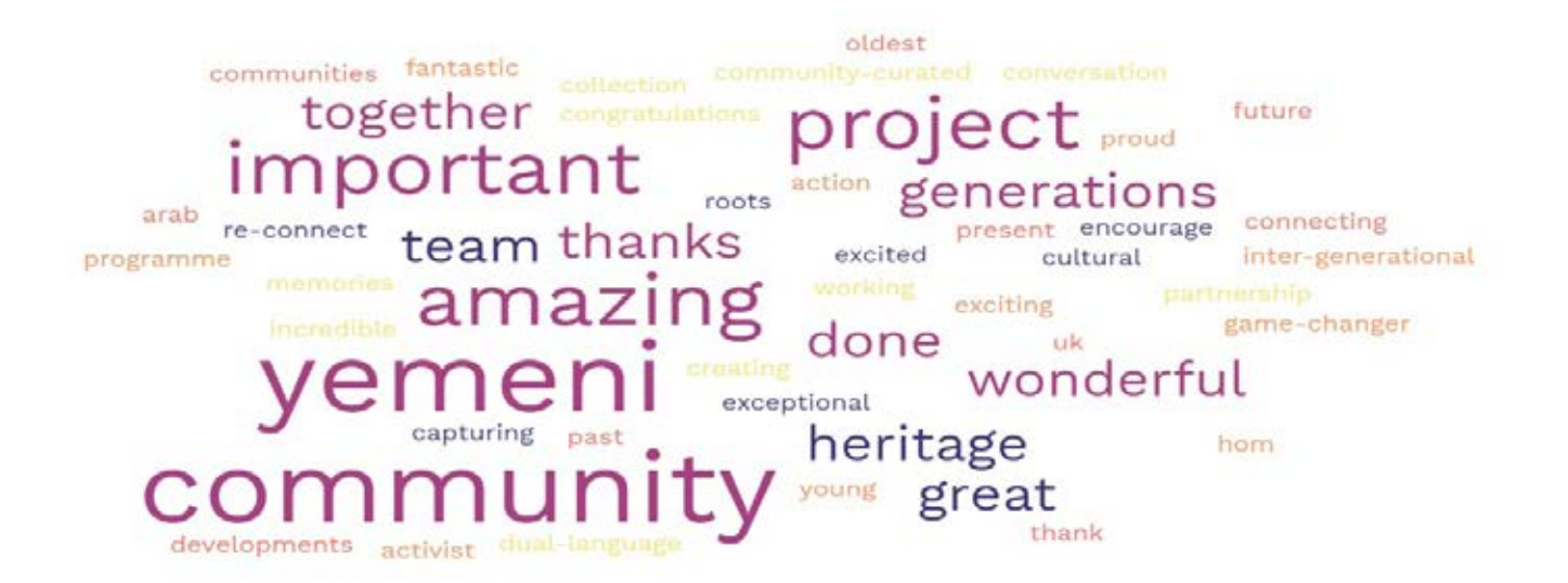
Figure 1 – Twitter word cloud (project launch February 2021)

Social media analysis of Twitter engagement at two significant project milestones shows real enthusiasm for the project and the people and organisations involved. This includes content analysis of Twitter data collected and analysed for example at the launch of the project by NML in February 2021 (see Figure 1 below) and at the launch of the Memories of Yemen app in June 2022 (see Figure 2). Data analysis shows positive affirmations of the project that are celebratory (e.g. 'well done', 'congratulations'), emotive (e.g. 'excited', 'proud') and communicate relatable characteristics of the programme (e.g. 'connecting', 'community'). It is important to acknowledge that the Twitter data is subjective and self-selecting in some cases. Most Tweets at the launch of the project for example come from individuals and organisations that are closely connected to the project from within the city of Liverpool. The second sample is more objective in its orientation, with Tweets from the wider professional museum and heritage community in the UK. This data provides an interesting illustration however of public response, promotion and communication.