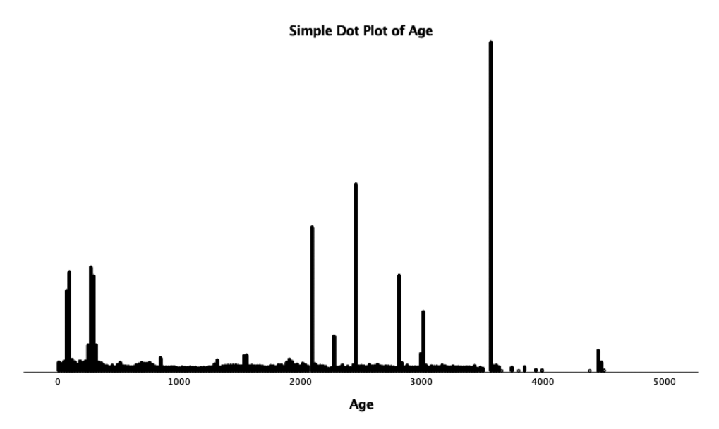
Figure 3. Publication of videos..

the evidence points towards the emergence of what is essentially an accessible Olympic videoarchive. However, this speaks to the importance of YouTube as one legitimate data source in megaevent research. As our examples illustrate, YouTube can provide scholars with overviews of content volume, strategies, and user engagement. Notwithstanding, it simultaneously yields insights into inter alia the official mega-event rhetoric and discourses, event promotion, visualisation of urban projects and, lastly, fans/citizens' perceptions (indicated by reactions and comments).