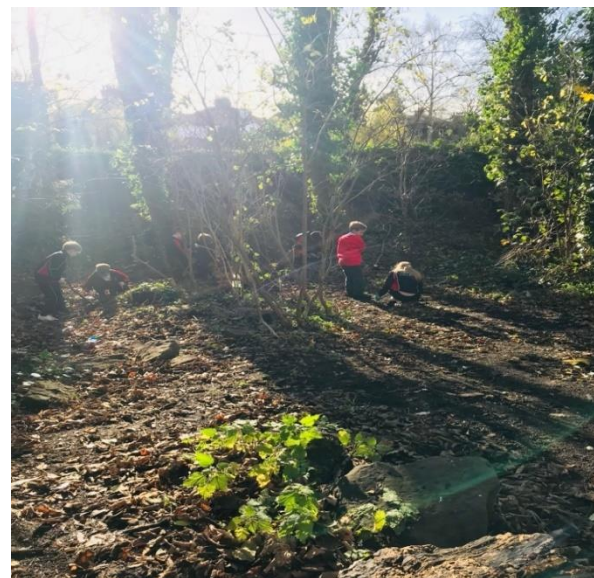
Figure 6: Sun through the branches

"I love the way the sun is shining through the branches of the trees. It looks magical." (Emily, age 8)