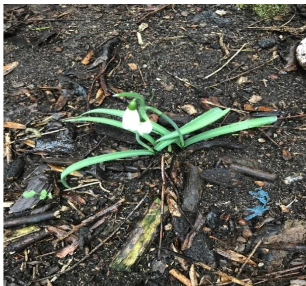
Figure 5: Growing from bulbs

"We did some digging here so that we could plant bulbs. I like to come back each week to see how they are growing." (Maltida, age 8)