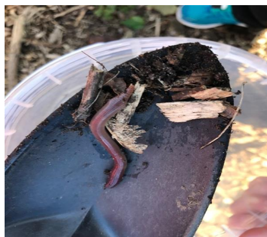
Figure 3: Worm