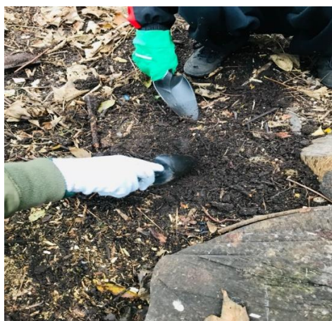
Figure 10: Area to dig

"That's my area to dig. My buried treasure is there." (Ryan, age 9)