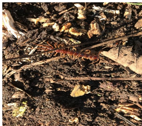
Figure 2: Centipede

"This is a centipede. You can tell by its shape and number of legs." (Macy, age 7)