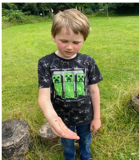
Figure 4: Bee

"Bees live in our Forest School. It was hard to capture one in a photo, but I managed. I used to be scared of bees but now I know how good they are for the flowers." Ryan, age 9