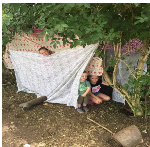
Figure 9: Den building