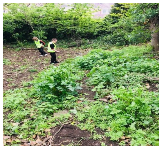
Figure 7: Forest School area

"I tried to take a photograph that captured all of our Forest School area, but I couldn't fit it all in." (Ryan, age 10)