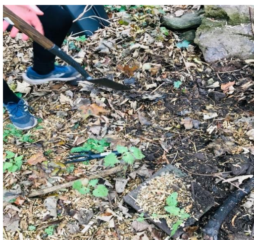
Figure 8: Digging for treasure

"Emily and I found coins buried in the soil. It's our secret treasure. We are buried it again after taking the photograph so that the coins remain in Forest School. It means we can play with them next time." (Rachel, age 8)