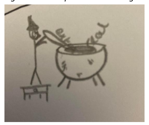
Figure 1: Participant 63's drawing

The drawing shows a person stirring potion in a cauldron. The text reads 'extra' going into the pot and 'real' coming out of it. The image accompanied the following quote; 'I think what they [the media] do is, what I call 's**t stir'. So they take a real story and add their own little parts to make it sound worse than it actually is' (participant 63).