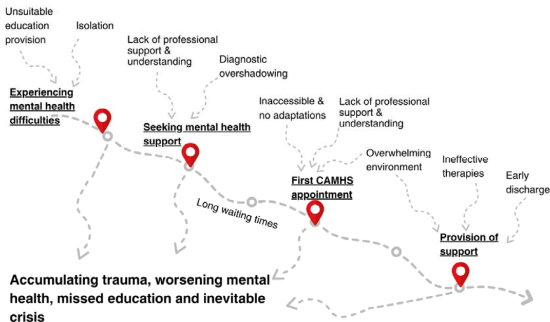
Figure 1. A summary of findings

SHORT TITLE: ACCESS TO CAMHS FOR AUTISTIC YOUNG PEOPLE