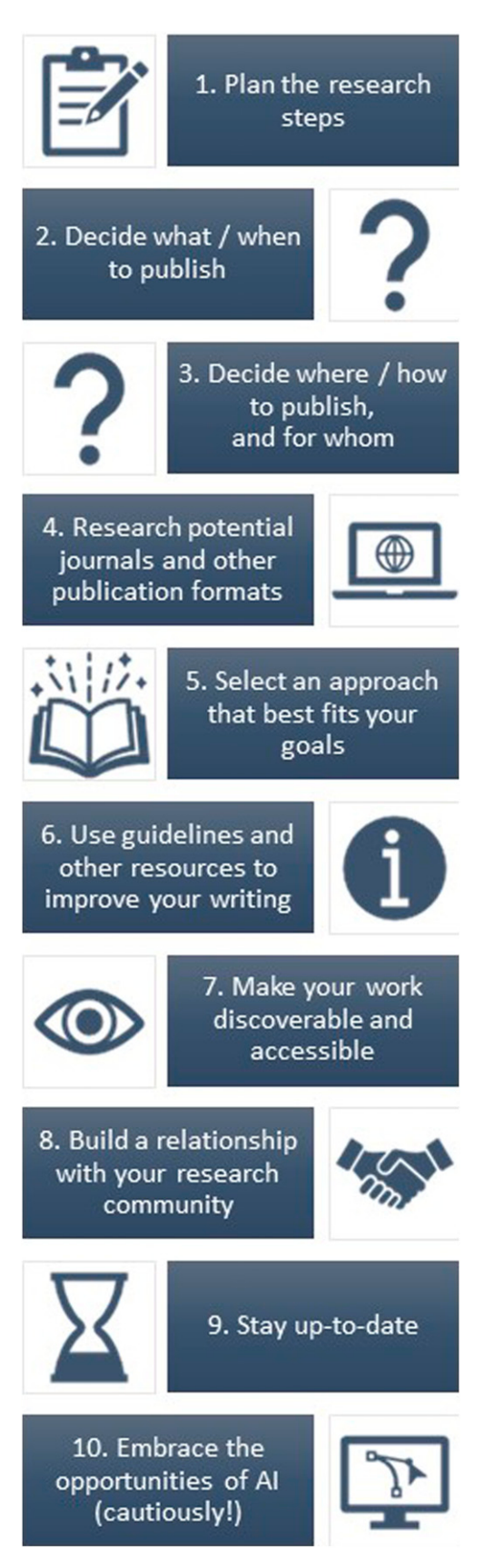
Figure 2. 'Ten top tips' in publishing, for early career researchers.