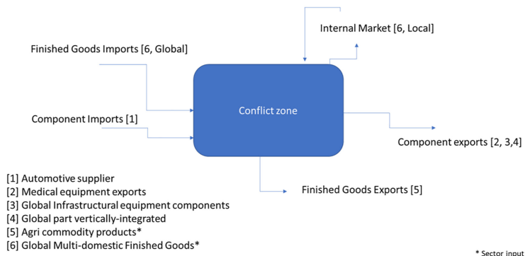
Figure 2. Interview case selection logic

The automotive supplier (1) , based in the UK, did not have direct sales into Russia but it did divert select sources from Russia to China in response to the conflict, indicating reconfiguration in terms of their network structure (5A) . The company’s existing dual sourcing strategy enabled this, reinforcing the lesson from the pandemic that source diversification is a key strategy albeit leading to further supply chain fragmentation. The