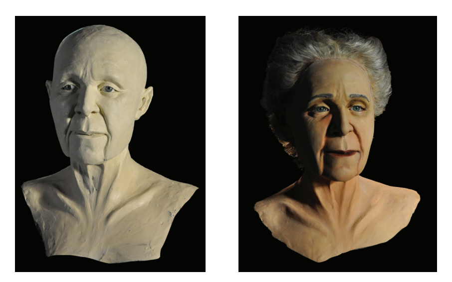
Figg. 2-3. The final result of the sculpting procedure with plasticine (left) and the completed reconstruction of ID 6: the plasticine model has been scanned and 3D printed with ABS, painted and finished with realistic eyelashes, eyebrows, high-quality glass eyes and hairs (right).