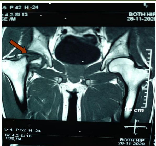
Fig. 3: MRI of hip joint showing avascular necrosis (stage iv) at right femoral head with surrounding marrow oedema and features of synovitis with mild effusion