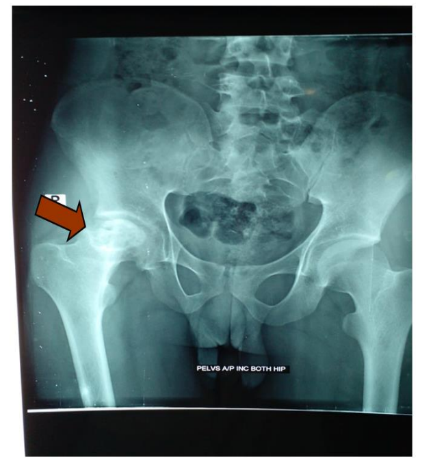
Fig. 1: Plain radiograph of hip joint showing sclerosis with articular marginal irregularity in right femoral head

radiotracer uptake in the head of the right femur, rest of the bone scan appears normal (Fig. 2). MRI shows avascular necrosis (stage IV) at right femoral head with surrounding marrow oedema and features of synovitis with mild effusion at right hip joint. No remarkable abnormality detected at MRI findings of left hip joint (Fig. 3). So finally patient was diagnosed as a case of avascular necrosis of right femoral head (stage IV).