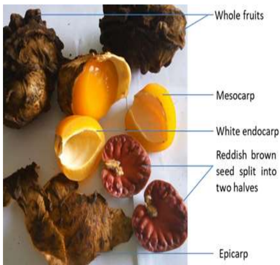
Plate 1: C. rostrata fruits and the parts

Preparation of Extract: The epicarp was separated from other parts of the fruit, cut into small pieces, and air-dried under shade at ambient room temperature for four months. The dried epicarp was pulverized using a blender and soaked in absolute ethanol for six days with regular rigorous shaking of the extraction vessel to disperse more phytochemicals. The mixture was filtered, and the filtrate was concentrated using the rotary evaporator at 45 °C and air-dried in the fume cupboard. Using the separatory funnel, the solid extract was partitioned between 70% methanol solution and n-hexane (3:2) into epicarp polar fraction and non-polar fraction.