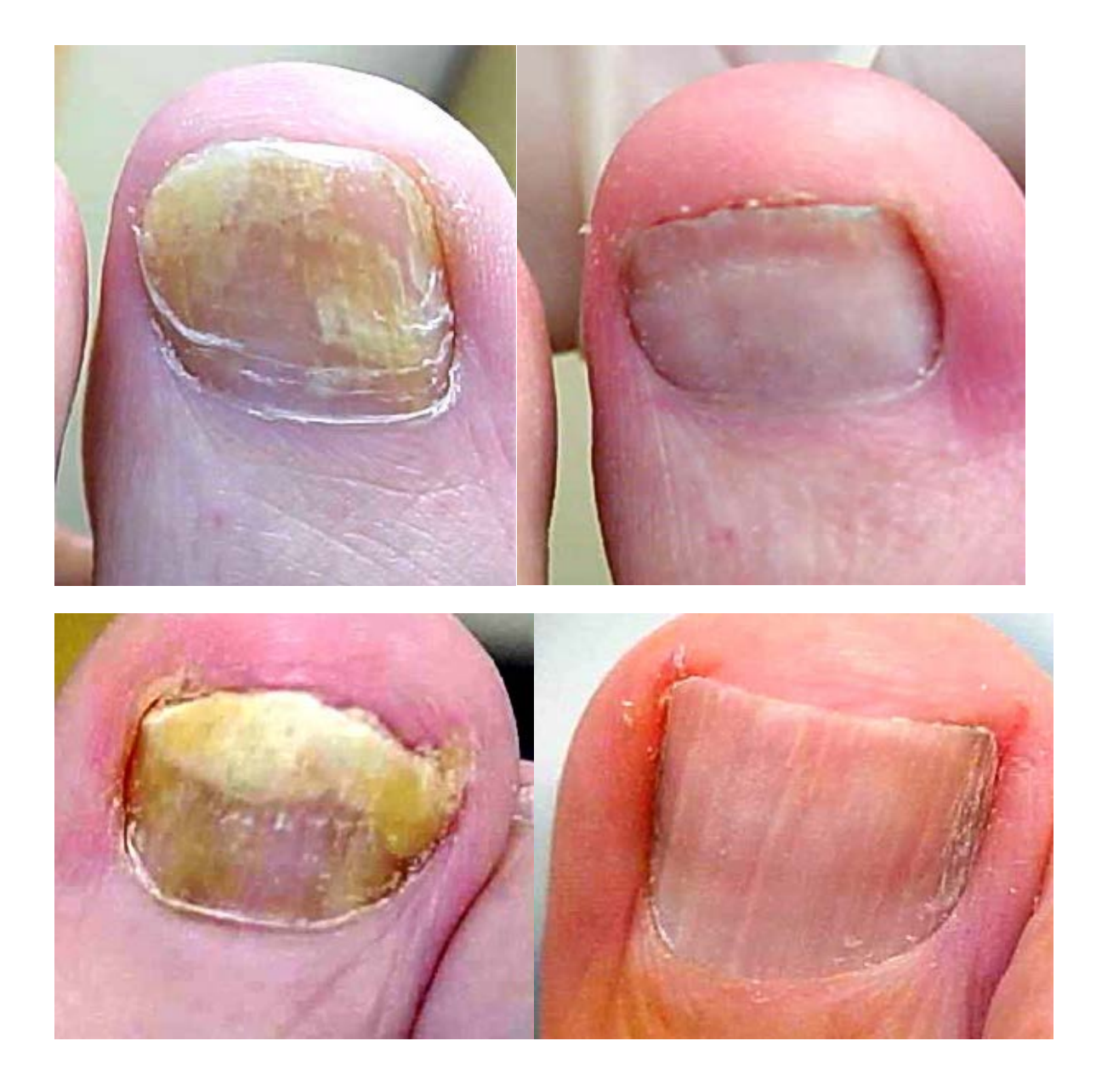
Figure 1. Complete clearance of nailbed infection after photodynamic treatment.

The data in Table 1 represent the initial results from an ongoing treatment protocol carried out in São Paulo since 2000, with the number of sessions varying with the severity of disease and speed of nail growth. As noted, 62 patients were considered to have completed therapy. Treatments often covered multiple visits and several patients dropped out due to dislike of the blue coloration of the nail and peripheral tissues (Figure 2). The number of sessions ranged from 1 to 22, and sessions occurred once a month. The average number of treatments for complete clearance was five (5.22) and some of the patients showing partial clearance are still under treatment. However, of those treated, none reported any pain, burning or discomfort during the illumination period, in contrast to other local photodynamic anti-infective approaches: for example, the treatment of acne vulgaris using aminolaevulinic acid [7]. Patients in the present cohort had generally tried to cure their infections previously using conventional antifungal agents, such as ketoconazole or terbinafine.