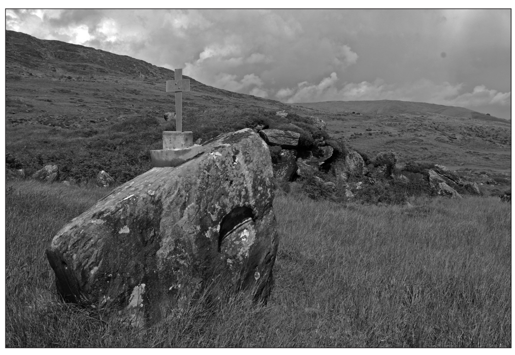
Plate 4: Cum an tSagairt Mass Rock

almost contiguous presence from prehistoric times to the present day (Ní Cheallaigh 2012, 369). More than most other archaeological monuments, Ní Cheallaigh believes that ringforts have 'lain at the intersection of diverging worlds of symbolic imaginings that encompass a wide variety of interacting social and cultural identities' in Ireland (Ní Cheallaigh 2006, 105). In county Mayo, Aldridge identified that burial grounds were often located both inside and outside a number of ringforts (Aldridge 1969, 83–85). The Drombeg Mass Rock, near Clonakilty in county Cork, is located within a ringfort and the tradition of a burial ground in pasture adjoining the west side of the ringfort was highlighted by the landowner (landowner, pers. comm. 20 April 2011). O'Sullivan and Sheehan identify that quartzite pebbles are often found associated with such burial sites (O'Sullivan and Sheehan 1996). They were also found during excavation of the Toormoor wedge tomb (O'Brien et al. 1989/90), near Schull, which was subsequently re-used as a Mass Rock during Penal times (site notice) and in association with Mass Rocks in Cork, such as Calloras Oughter and Curraheen in Uibh Laoghaire (Bishop 2015).