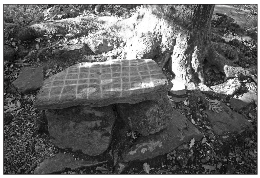
Plate 2: Old Altar Atone at Guagán Barra

1.8m by 1.5m is mounted on top of a level outcropping of rock to form an altar approximately 1m in height. A number of stones remain on the ground in close proximity to the Mass Rock which Ryan believes were used by the congregation during Mass (Ryan 1957, 26). The site is located about 70m south of the old Butter Path and would have been accessible from Coolmountain and the Keakill valley. There are other extant trackways in the area leading from Togher and Derrinacaregh (Miller 2009). Father Ryan records two Mass Rocks in the Coolmountain region; Toureen and Tullough (Ryan 1957, 26). Miller believes that Shehy Beg is possibly the Tooreen Mass Rock site mentioned by both McCarthy (1989) and Ryan (1957) given its close proximity to the townland of Tooreen and an absence of local knowledge in respect to any other site within the townland itself (Tony Miller, pers. comm. 26 August 2012). However, it is plausible that the Coolmountain site discussed below may be the 'Toureen' Mass Rock discussed by Ryan (1957) given its location close to the road which leads to the townland of Tooreen. It is possible that there were in fact three Mass Rock sites in the Coolmountain region.