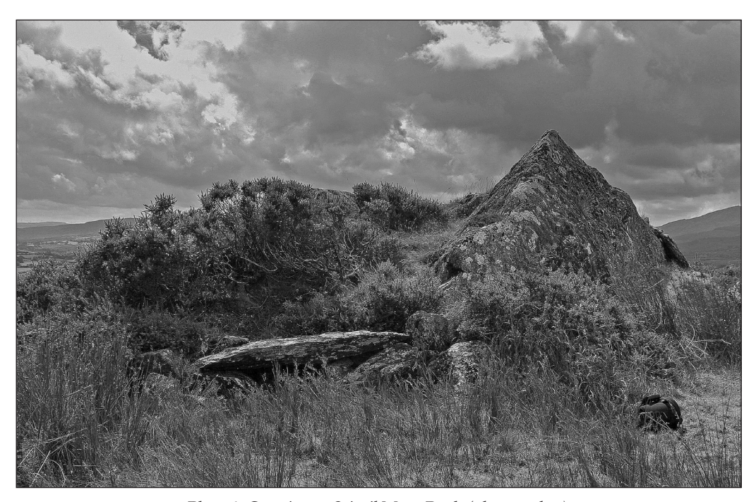
Plate 6: Carraig an tSeipeil Mass Rock

The shape of the Gourtnahoughtee Mass Rock in Uíbh Laoghaire would have made it a well-known topographical feature locally (Pl. 6). Identified by McCarthy (1989) as 'Carraig an tSeipeil' and described by Father Ryan (1957) as a 'little chapel', it is located on