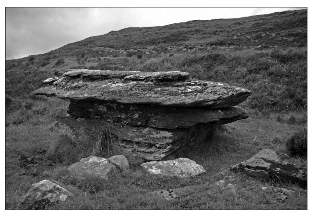
Plate 3: Shehy Beg Mass Rock

removed so that a chamber-like space has been created similar to the reredos at Curraheen. At the time of the visit the site was heavily overgrown with scrub.