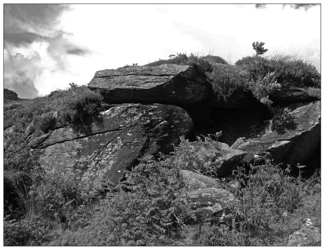
Plate 5: Priest's cave at Ballingeary, Cum an tSagairt, Mass Rock site

Depressions in stone, both naturally occurring and manmade, appear to be a feature at other Mass Rock sites in Cork including Heir Island and Kilmore in Uíbh Laoghaire . The Kilmore Mass Rock lies just to the north of a possible early ecclesiastical enclosure, burial ground and souterrain in the townland of Kilmore and consists of a large slab of rock measuring approximately 3.15m by 2.3m which sits on top of another similarly sized slab. There