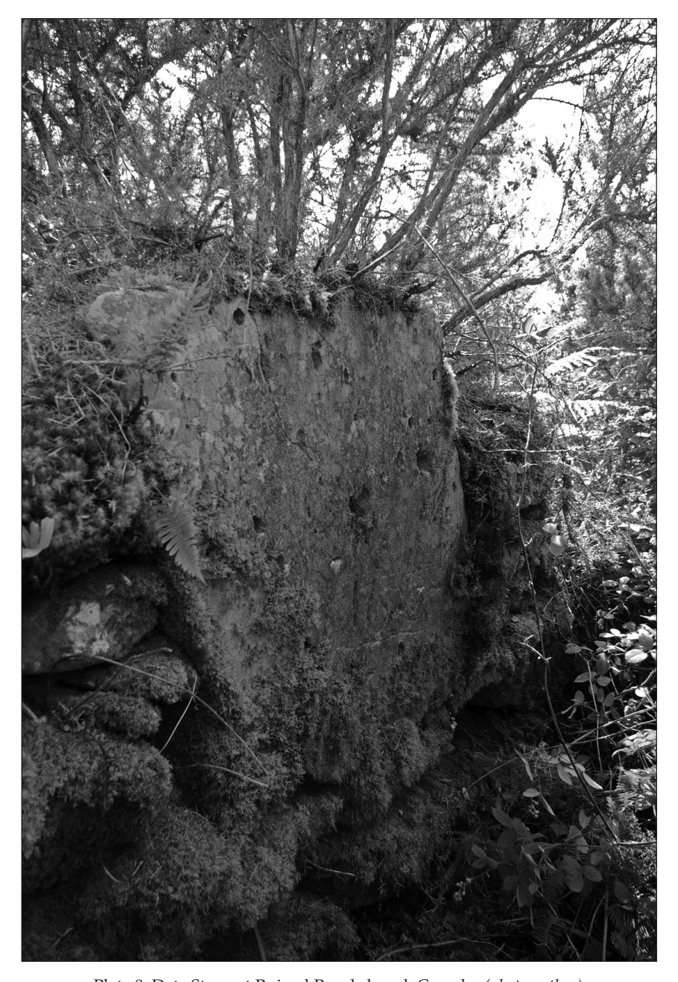
Plate 8: Date Stone at Ruined Penal chapel, Currahy