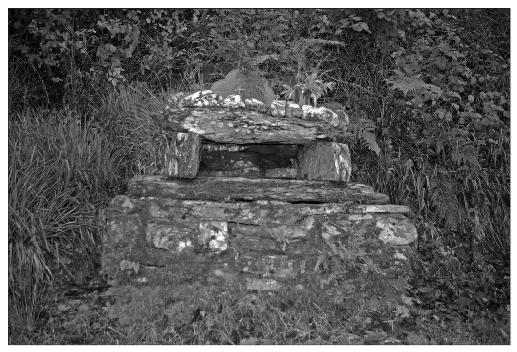
Plate 1: Curraheen Mass Rock

1842 (Ryan 1957, 27). The veneration for crucifixes, particularly Penal crosses, has remained a feature of Catholic tradition at pilgrimage sites (O Broin 1925, 110) and Ó Duinn argues that these small wooden crucifixes of the eighteenth and early nineteenth century must have played a singularly important part in the religious life of the people during the Penal era (Ó Duinn 2000, 119). A modern day 'Penal cross' had been placed in the reredos at the Curraheen Mass Rock and a number of other 'votive' offerings had been left at the site including a metal crucifix and flowers in a vase.