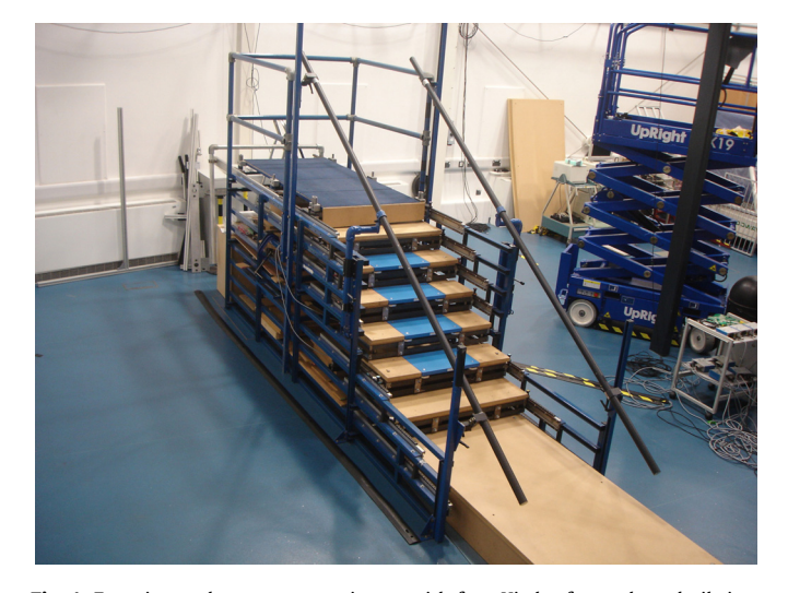
Fig. 1. Experimental seven-step staircase with four Kistler force plates built into steps 2–5. A moveable dolly mounted on the ceiling above the staircase allowed a safety harness to be used whilst participants walked along the staircase.

Maximum effort concentric (muscle shortening) and eccentric (muscle lengthening) ankle plantarflexion and knee extension moments were measured using an isokinetic dynamometer (Cybex Norm, USA) as previously described and performed by the same cohort [27]. Due to patient availability, maximum isokinetic joint moment were recorded for fifty-nine (CTRL: n = 18, DM: n = 27 and DPN: n = 14) of the original ninety-four participants. These muscle groups were chosen as the predominant muscle groups active