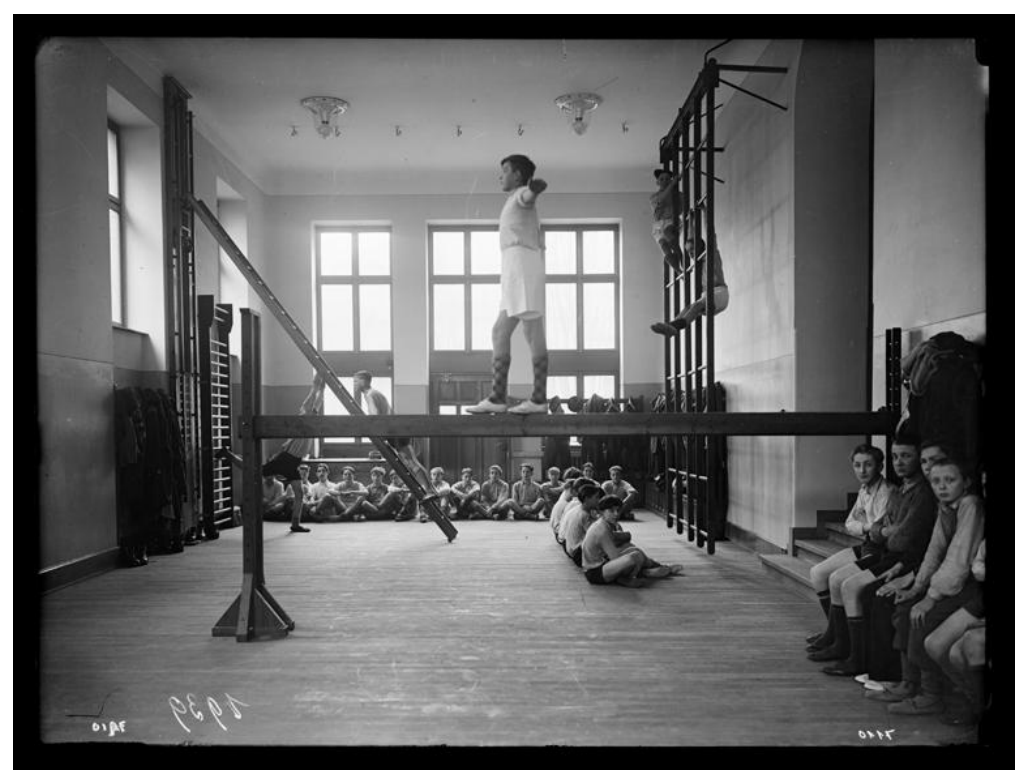
Figure 3. Gym of the Institut Emile Metz (1939). © Institut Emile Metz / [Inventory number HISACS002200V01] (CNA Collection).

touch and flow of movement and thus passed as the art of filing.<sup>54</sup> This choreography was embedded in a more complex chain of connections between human bodies and machines. In this chain a dynamographic file could become a lens to inspect, an instrument to train or correct, and statistics could in turn become the brain of an expert<sup>55</sup> by means of which pupils' performances were assessed, and compared with a norm with which they were expected to comply. Machines and bodies thus fused, both completing and perfecting each other in a human-mechanical constellation. The body, by being attached to devices which in the context of the then-reigning experimental system were supposed to be able to measure its output, and by performing in a mechanical choreography, implied and further reinforced human motor metaphors.