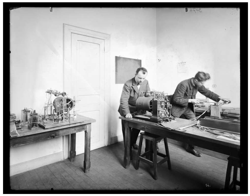
Figure 2. Filing test in the institute's psychophysiological laboratory. © Institut Emile Metz / [Inventory number HISACS000713V01] (CNA Collection).

fusions made evident infinite possibilities.<sup>47</sup> As an agent, the image enabled such understandings of the interrelation of bodies and machines and added new layers of meaning around the physical and the mechanical in the field of education and beyond.