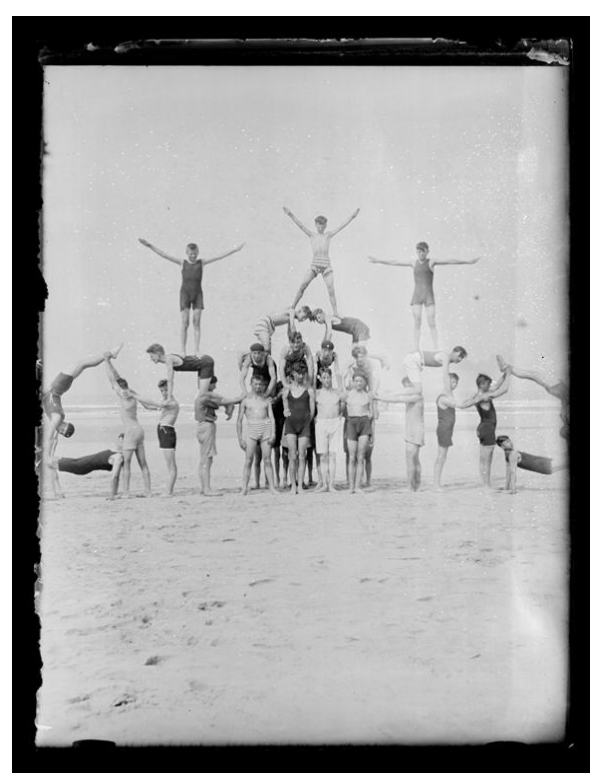
Figure 6. Pupils in a geometrical formation on the beach in Belgium. © Institut Emile Metz / [Inventory number HISACS000207V01] (CNA Collection).

inside the gear wheel, like the pointer of a clock, can be said to symbolise subjection to the rhythm of the machine imposed by the industry's quest for maximum productivity.<sup>85</sup>