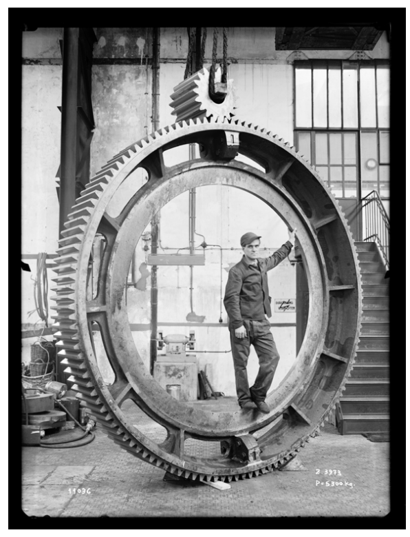
Figure 5. Worker standing in a crusher's gear wheel. [Inventory number HISACS000849V01].

The human engine produces effort. The worker is the owner and employer of his own living machine. (...) [T]his machine comes into contact with the great industrial machine of his employers, either through union with it or by opposition to it. <sup>78</sup>