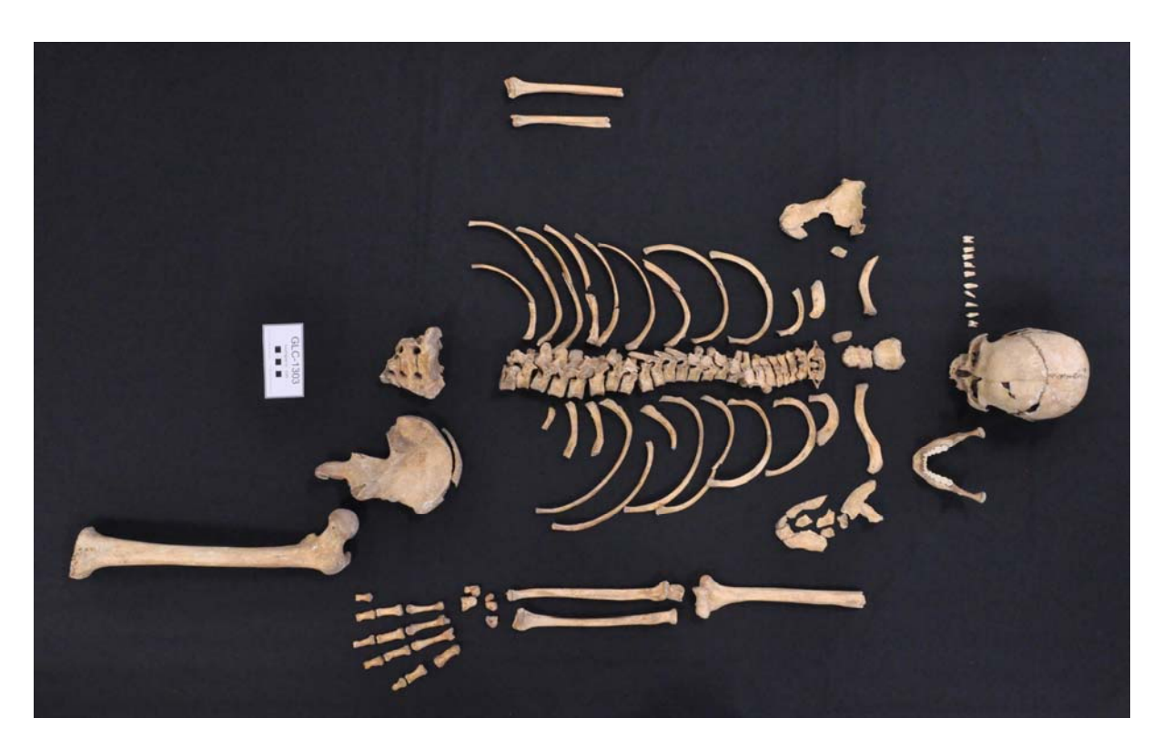
FIGURE 1. Overall view of skeleton 1303 in anatomical position