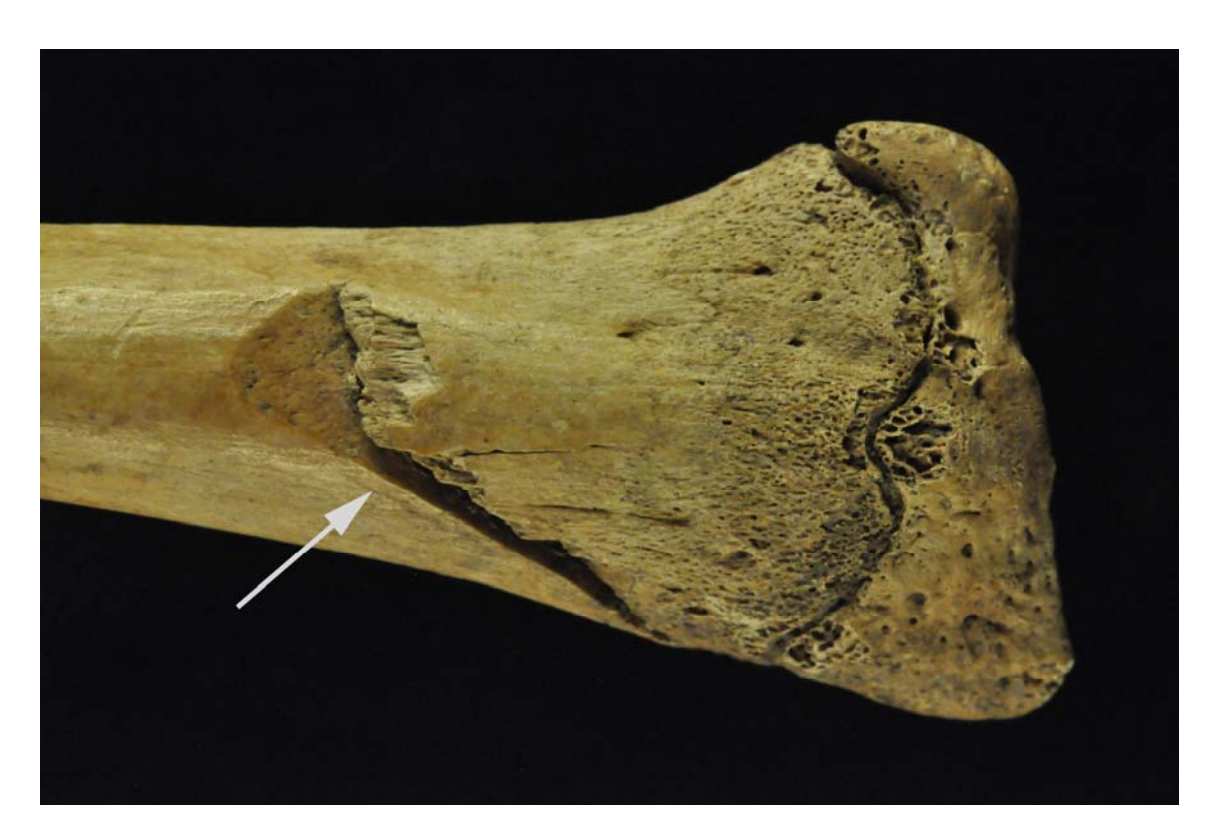
FIGURE 3. Close-up of the trauma to the posterior distal radius. Note the partially fused epiphysis.