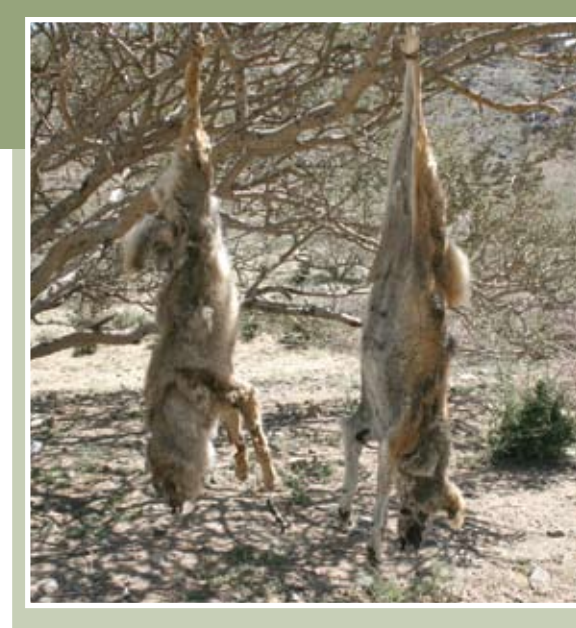
Fig. 2: Wolf carcasses in hanging tree in the An Namas area, western Saudi Arabia.

ters with humans (Figure 2). Notwithstanding this persecution they are still viewed as numerous in certain inhospitable mountainous areas by Bedouin who often loose domestic stock to wolf predation. In a recent survey in the western Asir (An Namas/Bisha area) the wolf carcass encounter rate was 0.12 wolves per km. Elsewhere, they are expected at lower densities and anecdotal evidence suggests that they are highly mobile seasonally in Saudi Arabia. The importance of establishing and maintaining protected areas (including active enforcement thereof) in the mountainous areas of Saudi Arabia would not only benefit wolves, but also other species (e.g. ibex, mountain gazelle) facing a tentative existence. Wolves may be able to re-establish in areas where active persecution is limited such as in certain protected areas as recently confirmed from the lbex Reserve (approximately 180 km south of Riyadh) in central Saudi Arabia.