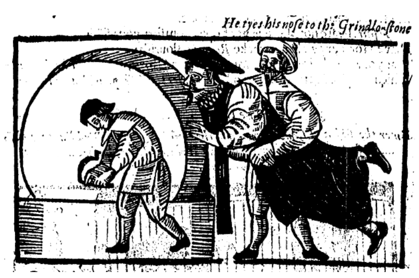
Fig. 8. By38a L364 641n. [Richard Overton], A New Play Called Canterburie His Change of Diot . 1641. Sig. A3r. Used by permission of Beinecke Rare Book and Manuscript Library, Yale University.