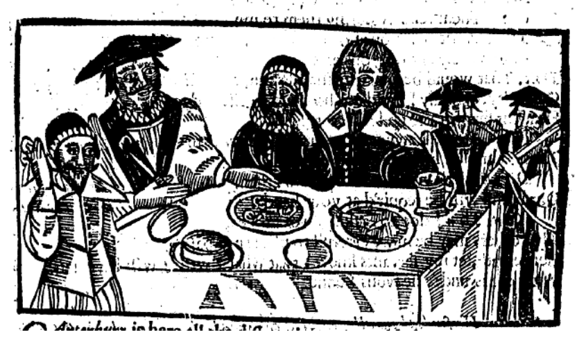
Fig. 7. By38a L364 641n. [Richard Overton], A New Play Called Canterburie His Change of Diot. 1641. Sig. A2r.

Enter the Bishop of Canterbury, and with him a Doctor of Physicke, a Lawyer, and a Divine; who being set downe, they bring him variety of Dishes to his Table,