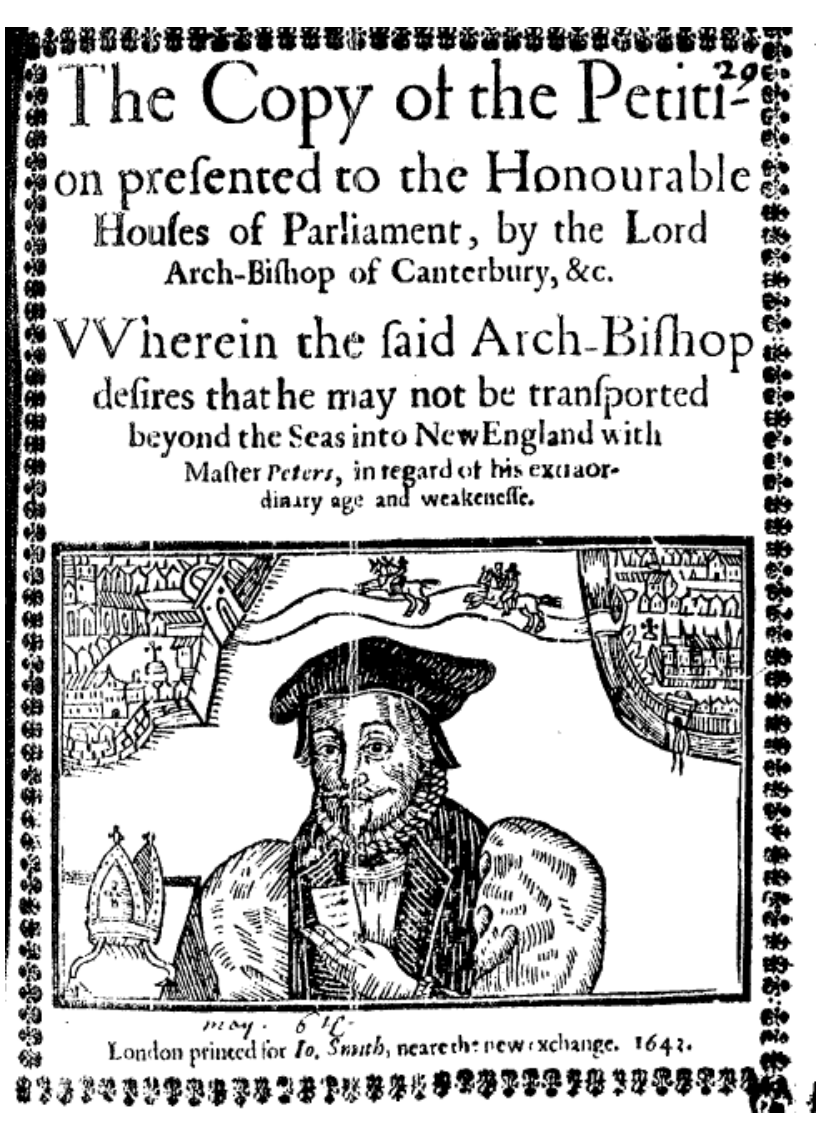
Fig. 4. E.100.(29.). The copy of the Petition presented to the Honourable Houses of Parliament by the Lord Archbishop of Canterbury, &c., wherein the said Archbishop desires that he may not be transported beyond the Seas into New England with Master Peters, in regard of his extraordinary age and weaknesse. 1643. Title page.