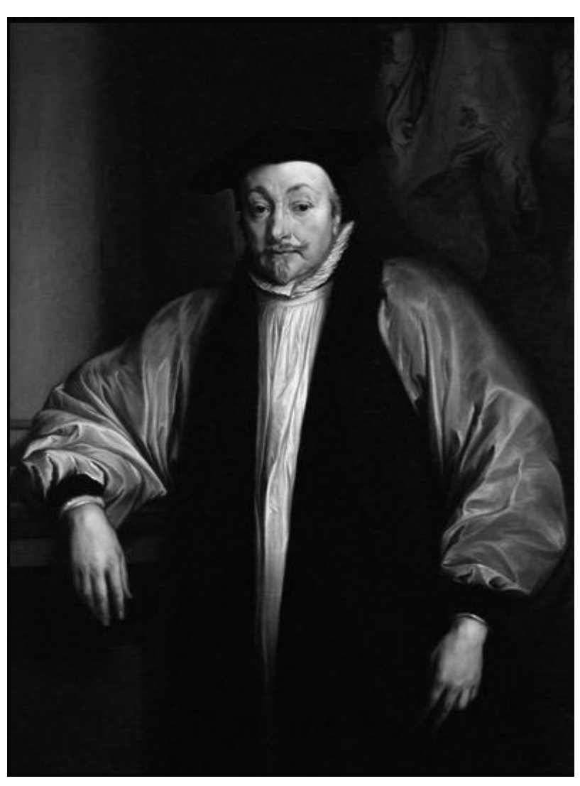
Fig. 1. Anthony van Dyck, Archbishop Laud , c.1635 — 1637