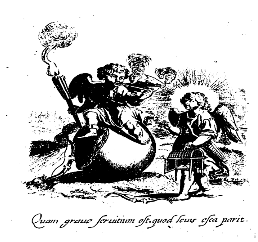
Fig. 5. STC 20540. Francis Quarles, Emblemes . 1635. sig. F2v.