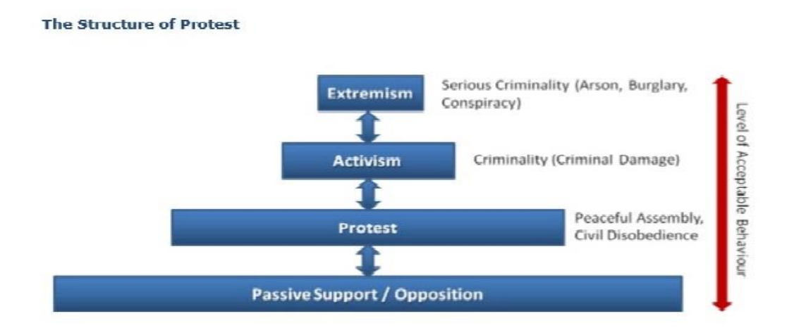
Figure 1 – The Structure of Protest, taken from ACPO (2015) Policing linked to Onshore Oil and Gas Operations , London: National Police Chief's Council, 8.

The diagram and explanation are included as part of a discussion about the benefits of establishing good relationships with protesters and local supporters at anti-fracking protests, in line with the commitment to dialogue. The breakdown of the structure of protest here though defines protest in terms of accepted tactics in distinction to activism defined by criminality. Here the divide between these groups mirrors the distinction drawn between 'contained' and transgressive protest that Gillham (2011) argues has been central to targeted protest policing in the US in recent years. Indeed, the Network for Police Monitoring [Netpol] have pointed out, 'the guidance proposes that these categorisations will be used to 'tailor' police responses' (2015a: 9).