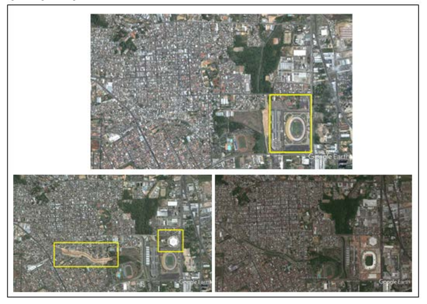
Figure 1. Transformations around the Arena da Amazônia and Alvorada Neighbourhood in Manaus, Brazil. Top image, Google Earth, 21 June 2005; Bottom Left image, Google Earth, 25 July 2007; Bottom Right image, Google Earth, 28 December 2013.

Based on the aerial images around Vivaldão Stadium, it appears transformation focused on easing of access to the venue. Looking at the landscape in July 2007, several structural land-use change immediately adjacent to (north of) Vivaldão Stadium begin to appear. Also, some road redevelopment