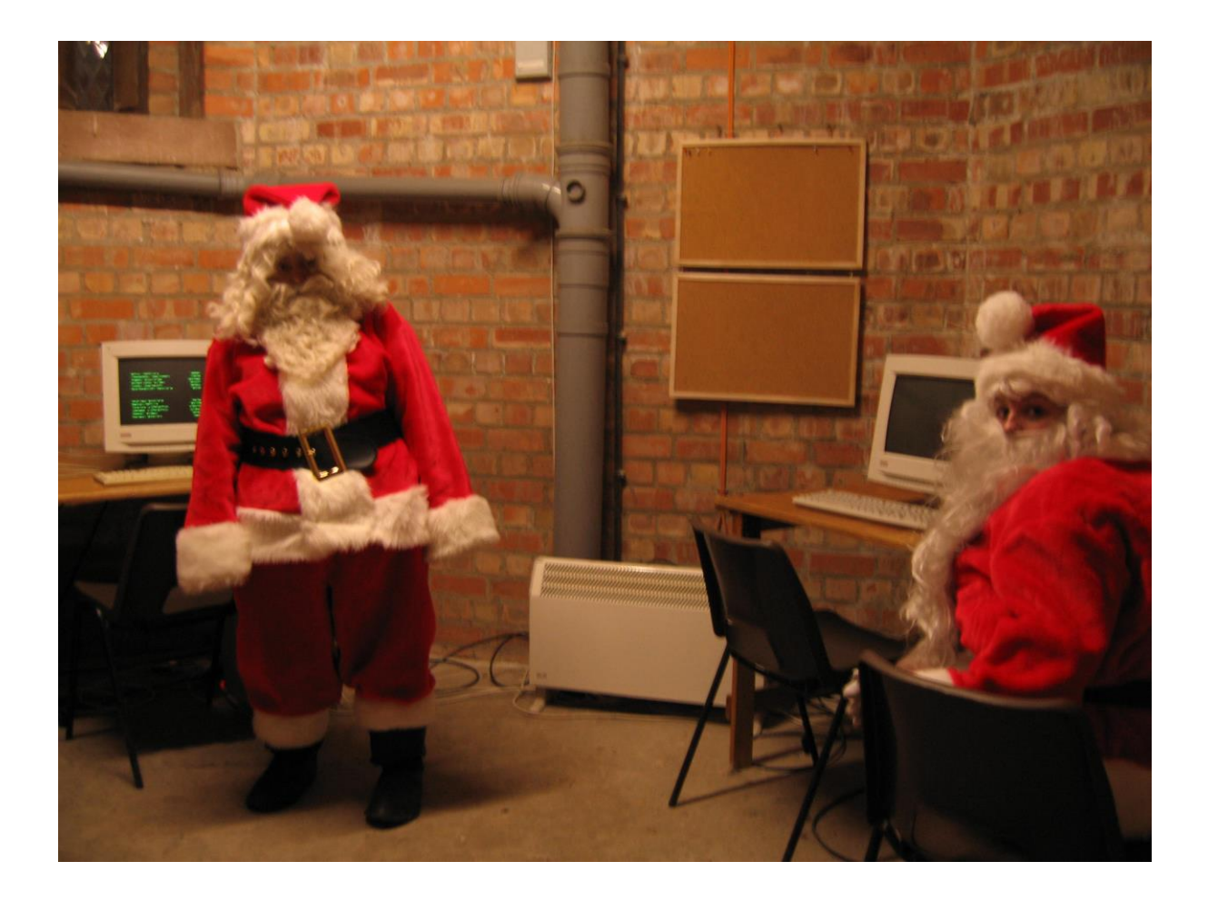
Figure 2: Bedraggled Santas. Photograph by Lois Maskell (Set Designer). Concept and Artistic Direction by Tristan Sharps.

Someone may knock on the door, or, after a while, the door will slowly and slightly open. Peeking inside, we can see a polygonal room. Facing each wall is a red-suited figure. Huddling over portable heaters, the red figures tap away at identical computer terminals in doleful unison. After a while, shyly at first, they start to look round at us. Eventually, we are being stared down by a battalion of bedraggled Santa Clauses. Pausing from their weary typing of (what the more inquisitive observers will detect to be) shopping lists, the Santas seem faintly sheepish at first, then increasingly ashamed. The scene reads as a sardonic betrayal of the magic of Christmas.