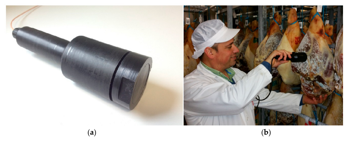
Figure 1. (a) The microwave probe and (b) the probe demonstrated at dry-cured production facility in Spain.

The system consists of a probe, some means to generate microwave energy, and a system for analyzing the return microwave signal to predict aw. During validation of this technique a Vector Network Analyser (Rohde & Schwarz, Oslo, Norway), or VNA for short, is used to generate microwave spectra and detect corresponding changes. The sensor is a single port device, connecting to the VNA via a coaxial cable. The probe is designed such that the user must hold the sensitive end against the measurement target with minimal pressure. After a few seconds, sufficient data is acquired to predict the aw. The probe is illustrated in Figure 1, both alone and in example use at a production plant in Spain. While the original idea for this device was monitoring high-value curedhams, it is anticipated that the same principle can be applied to other meat products, including sausages. Furthermore, on-going work shows that the device can be used successfully on products in vacuum wrapping which broadens its potential for use throughout the dry-cured meat value chain.