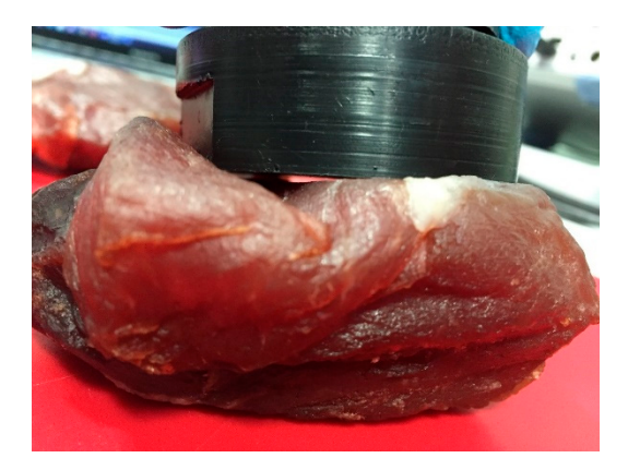
Figure 3. Uneven surfaces, which are more prevalent as the product dries and hardens, introduce gaps between the sensitive surface of the microwave probe and the sample.