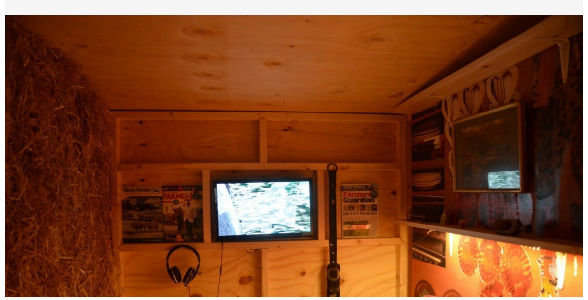
Tracing the Landscape (2018) Abbot Hall Art Gallery