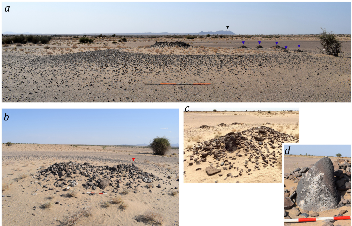
Figure 2: a. View of the southeastern face of the stone platform with large central cairn and five smaller cairns (blue triangles) – Lothagam Ridge, the site of well-known Pillar sites, can be seen on the horizon (black triangle); c. the large central cairn – the standing stone or pillar can be seen on the right of the cairn (red triangle); d. a frontal view of standing stone at the head of the cairn; e. the standing stone.

5005-4980, Beta-447866) using bulk organics from a single sherd of Nderit ware found on the surface of the platform. Chronologically, this places Aliel in the earliest phase of construction of the oldest ‘Pillar sites’ of Turkana, Lothagam North and Jarigole, currently dated to 5033-4870 Cal BP and 5270-4857/5212-4853 Cal BP respectively (Grillo & Hildebrand 2013). It also supports the view held amongst the local Turkana population, that the monument is not recent. Widespread oral traditions describe Aliel as the resting place of an ancient and powerful mganga -- witch doctor-- that lived in the area prior to the arrival of the Turkana people.