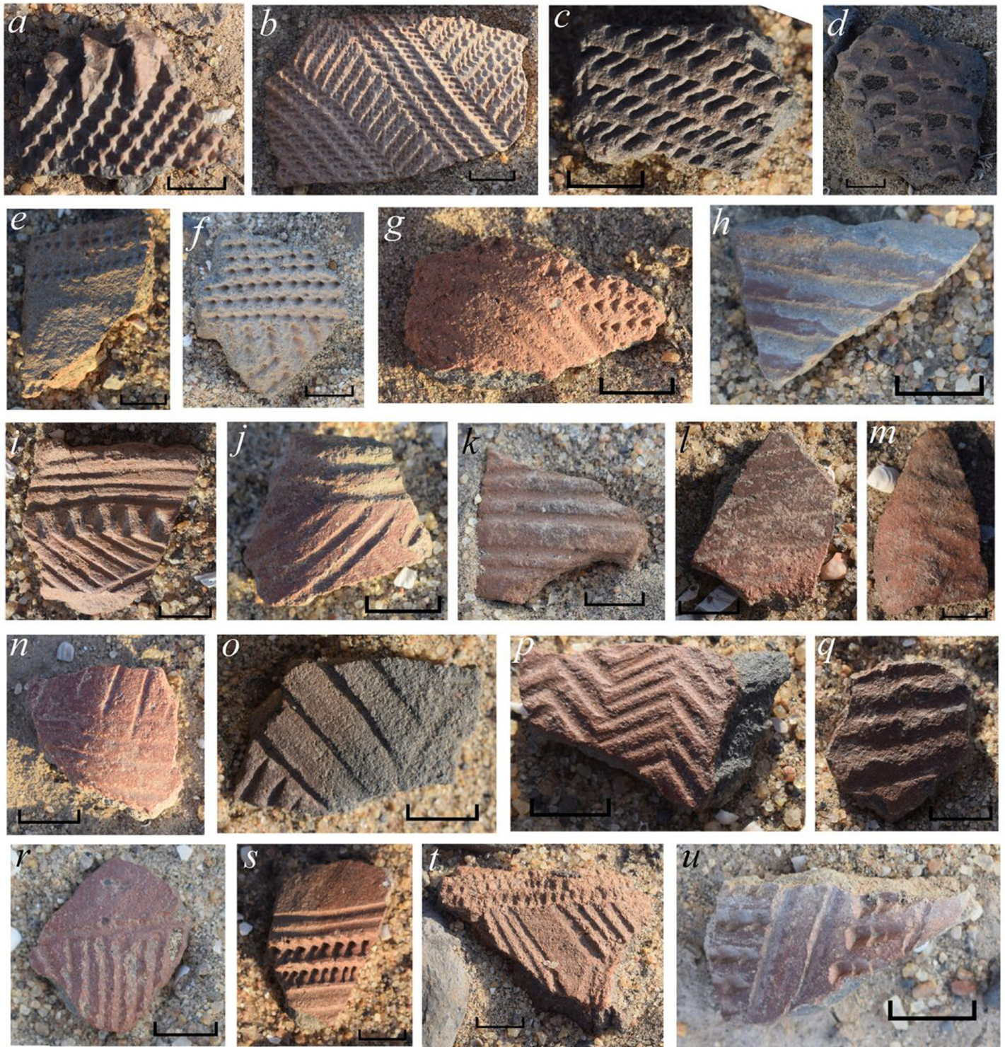
Figure 4: Examples of the range of pottery decoration types on the stone platform of Aliel. a Nderit ware rim sherds everted; b-d Nderit ware body sherds showing evidence of different stylus types; e Kansyore-like ware plain rim sherd; f-g Kansyore-like ware body sherds; h-j rim sherds of grooved decoration (i-j with flaring lip); k-l grooved decoration body sherds; m ripple decoration body sherd; n-o body sherds with zoned groove decoration; p grooved chevron decoration; q non-uniform grooved decoration; r-u multi-pattern grooved and stamped body sherds. Scale is 1cm.