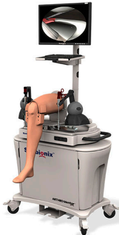
Fig 3. Simbionix Arthroscopic Simulator [8]

Simbionix's Arthro Mentor is a medical training simulator with haptic feedback that allows trainees to practise arthroscopic procedures and develop the relevant skills related to the anatomical structure of the shoulder and relevant biomechanics, and help build their knowledge of shoulder arthroscopy [7].