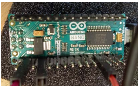
Fig 6. Arduino Nano Microprocessor

An Arduino Nano is used to communicate between the FSR and the PC, so that data can be accessed and recorded out into external software for different purposes, potentially so it can be accessed later and compared with updated datasets.