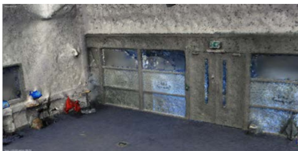
Fig 12. 3D world built from unstructured point cloud data

1) The first method looked at was photogrammetry, which converts key features in photographs to tie points, creating a point cloud in a 3D space and then generating a 3D mesh-based off of the point cloud, then exported as a 3D model. The benefit of photogrammetry is the creation of environments and models by way of image capture, which is mostly automated, except for user-defined variables to adjust the output of the application. The most significant limitation is that the mesh it generates has an excessive number of polygons and developed in 'tris' as opposed to quads, which are easier to work with and manipulate, the generated mesh during this study was 1,818,940 polygons. Additionally, decimation causes noise and distortion to the mesh and textures and does not efficiently reduce the polycount.