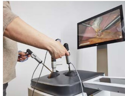
Fig 1. LapSIM Laparoscopic Training Simulator [19]

LapSIM is a screen-based training simulator with haptic feedback that is used to train clinicians in endoscopy. The platform allows trainees to develop their fine-motor and hand-eye coordination skills related to endoscopic procedures through a series of task modules and perform a virtual endoscopy [5].