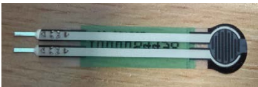
Fig 5. Force Sensing Resistor (FSR)

It involves connecting a Force Sensing Resistor (FSR) to an Arduino Nano. When the pressure gets applied to the pressure-sensitive layer, the conductive layers connect, and the resistance decreases proportionately to the amount of force applied. Additionally, the conductivity increases as physical forces are applied. This change is due to the fall in resistance.