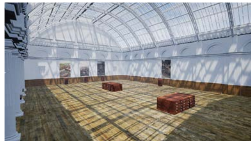
Fig 9. 3D world produced using image/scale references

efficiency of the final model. 3D modelling is more time consuming; however, as all the geometry has to be built manually and textured with UV maps before being usable by game engines [14]. Figure 11 demonstrates the use of 3D modelling for the level design of the Virtual Anthropology Museum. The total polycount for this environment is 239,580 polygons.