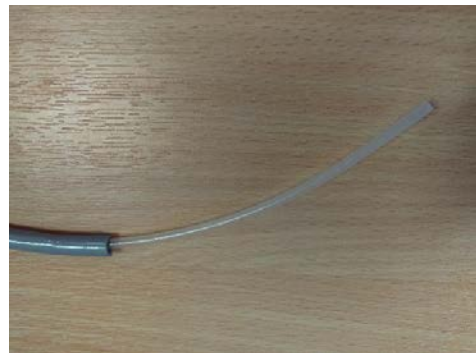
Fig 8. Polyurethane tubing simulating artery and catheter

Initial tests utilised paper-based tubes of varying sizes to determine if sliding a smaller tube through a larger tube would trigger a reading from the sensor. These were considered successful and led to tests conducted with polyurethane tubing that provides flexibility and the ability to simulate the undulation and bending of arteries that provide trainees with resistance and challenge.