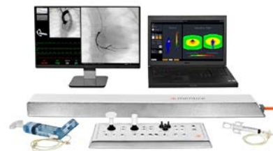
Fig 2. Mentice VIST G5 Endovascular Simulator [20]

Mentice's Vascular Interventional Simulation Training (VIST) is a high-fidelity endovascular training simulator that allows trainee interventional neuroradiologists to conduct a full endovascular thrombectomy. The simulator breaks the procedure down into distinct phases; each one simulates a different step in the process of removing a blood clot inside a patient. The system uses real patient cases, which provides trainees with a model solution for them to complete [6].