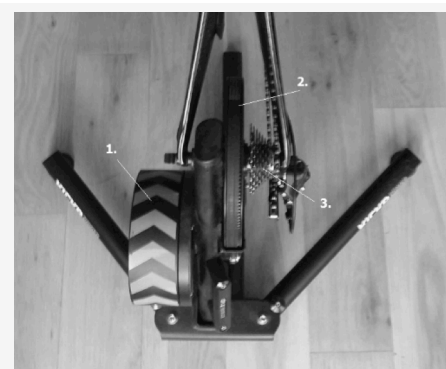
Figure 1. a) The attachment of the KICKR to the drivetrain of a bicycle; & b) Superior view. 1: Flywheel; 2: Belt drive; 3: Cassette.

purposes (Zadow, Kitic, Wu, Smith, & Fell, 2016). This investigation, however, was limited to only one KICKR unit, so no assessment of between unit variability was available. Additionally, the reliability of the KICKR was not examined. Therefore, the aim of the current investigation was to: i) assess the accuracy and reliability of several KICKR units and ii) compare it to the more established SRM power meter, when tested against a first principles dynamic calibration device.