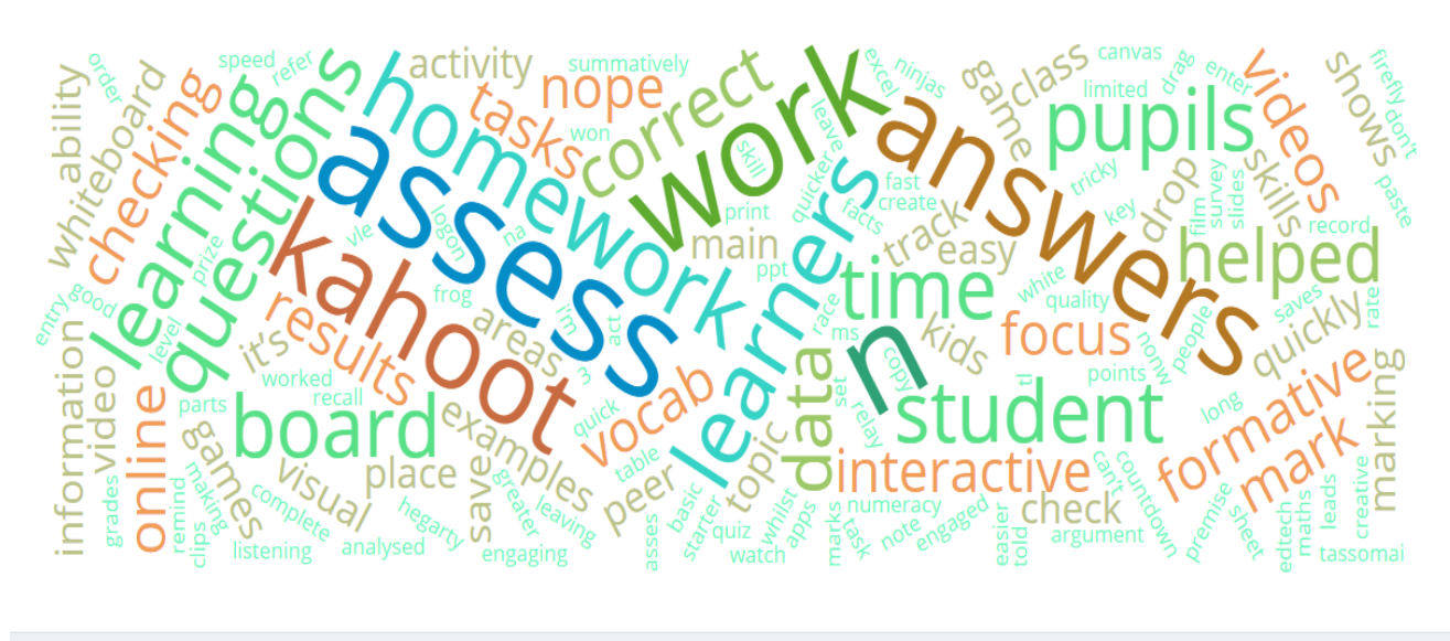
Figure 3. Word cloud, Question 5.

In terms of quantitative data approximately 45% of participants had used edtech to assess at this stage in their training. This could reflect that fact that this was early in the training for the majority of participants, so assessment was not something that they had mastered at this stage. As indicated by the word cloud, (Figure 3.), the dataset demonstrates that the participants had sometimes wildly differing experiences of and attitudes towards using technology in the classroom. It also showed that there does not seem to be any kind of consistency or policy directive, as there are regarding numeracy and literacy, for example, or equality and diversity. These issues will be examined in the Discussion section below.