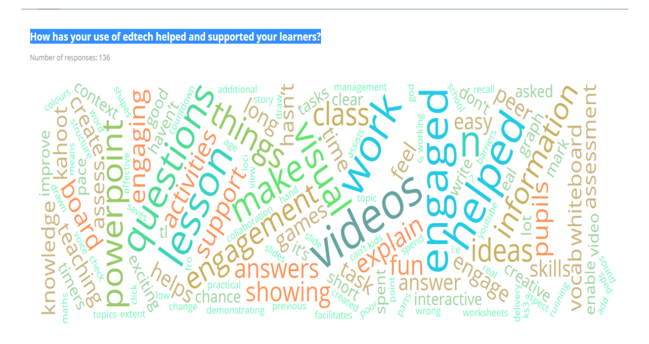
Fig 2: Word cloud, question 4.

Question 4: How has your use of edtech helped and supported your learners?