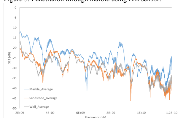
Figure 4. Electromagnetic response for different building materials