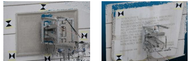
Figure 2. The example of the EM position with dense point cloud used for visualisation.

order to determine the penetration through the marble specimen. The averaged data with and without aluminium sheet placed behind the marble specimen is presented in Figure 3. The results show that reflected signal is greater when the aluminium sheet is placed behind the sample. This is due to the dielectric properties of the metal, which reflects the EM spectrum, i.e. blocking EM signal from penetrating further. In addition, this demonstrated that the proposed sensor is capable of penetrating through marble specimen, which is currently a major drawback of mostly used techniques in the field of cultural heritage.