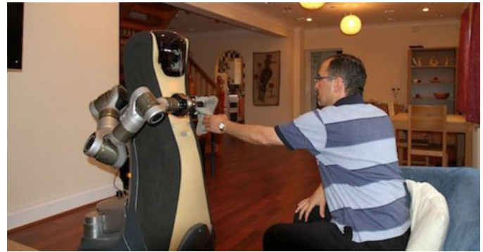
Fig. 1. Care-O-bot robotic assistant operating in the University of Hertfordshire’s Robot House.

Verification is the process of assessing whether a system meets its requirements; formal verification is the application of formal (i.e., mathematical) methods to the verification of systems. The formal verification approach used in this paper is based on model checking [1], in which a model of a program or process is constructed. This model is typically nondeterministic so that each “run” (or simulation) of the model can be different from the last. A program called a model checker exhaustively analyzes all possible executions of the model in order to establish that some property, usually derived from system requirements, holds. Therefore, it is possible, for example, to use a model checker to formally verify that in every execution of a given program, the program will always reach a desirable situation. In other words, we can formally verify that a given requirement holds.