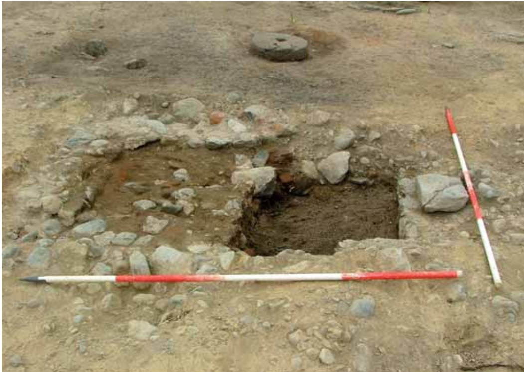
Illus. 8—A mid-excavation view of oven 1, from the west, with the rotary quern-stone in the background (Richard Jennings).

Glanworth Castle, Co. Cork, revealed evidence for two late 16th/early 17th-century ovens (Manning 2000). A late 17th/early 18th-century oven was excavated at O’Dea’s Castle in Dysert O’Dea, Co. Clare (Gibson 1997). At Drumlummin, Co. Tipperary, a mural bread oven was uncovered in a mid-17th-century house (Cleary 1987, 124–5). Evidence from England reveals that bake-ovens were often located outside buildings (Hurley & Sheehan 1997, 274).