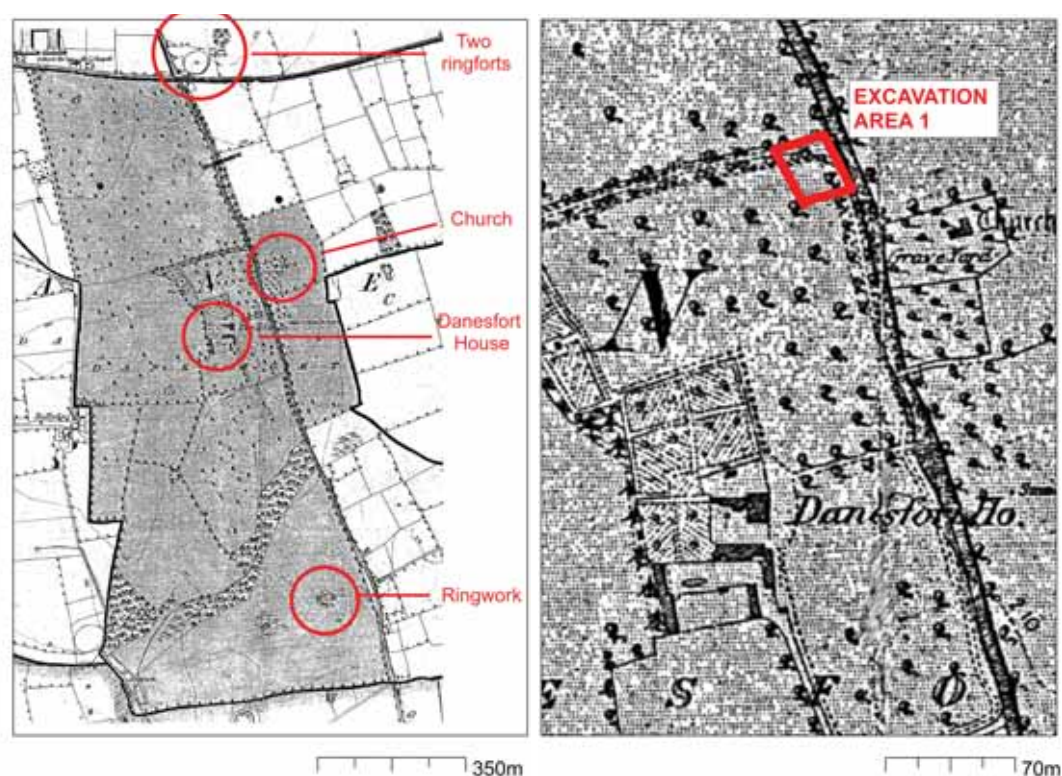
Illus. 2—First edition six-inch Ordnance Survey map (sheet 23, surveyed 1838, published 1840) showing the location of Danesfort demesne and house. The road running north–south and passing between the church and Danesfort House is the Kilkenny–Waterford road, and the road running west–east beside the two ringforts is the Callan–Bennettsbridge road (Ordnance Survey Ireland).

context and to consider its function with the help of maps, documentary sources, paintings and evidence from the few comparable archaeological sites that exist across the country.