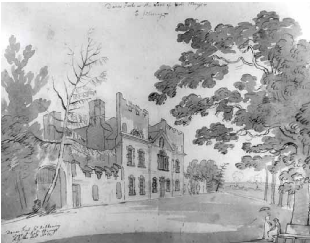
Illus. 6—The painting of Danesfort House by R Gibbs (from McEvoy 2006).

Archaeological evidence points to the construction of the roadside cottage during the mid-18th century. The evidence consisted of a cottage (structure 2) with an adjoining underground storage chamber or cellar (Illus. 5 & 7). It included a cobbled floor surface, 3.74 m by 3.27 m in size, and the remnants of two wall foundations. It is very likely that these were the vestiges of a larger wooden building, probably a cottage, which did not survive. The adjoining cellar contained four stone walls up to seven courses high, with a set of stone steps on its western side leading towards the southern wall of the cottage, where there was evidence for a door. It is probable that the cellar itself had a raised roof or ceiling to protect objects or produce stored inside and to ensure ease of use, as it was excavated to only 1.2 m below ground level. The changes were not just restricted to the construction of a cottage. A 30 m by 10 m area behind the cottage and cellar was stripped of its topsoil and