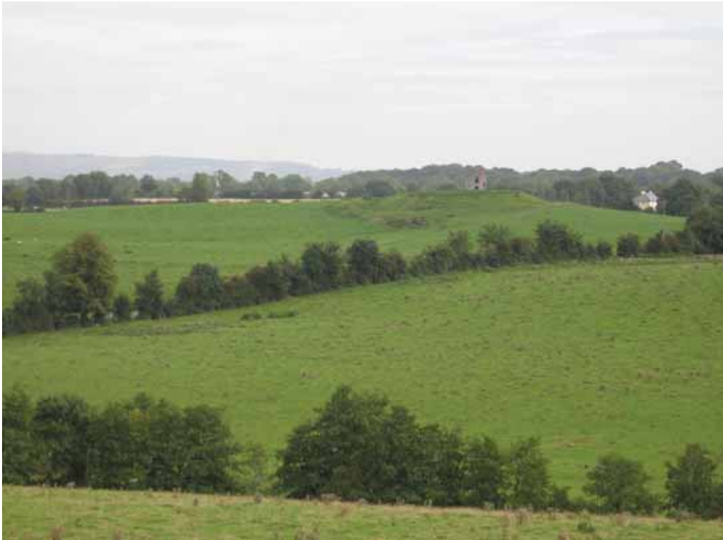
Illus. 9—The 18th/19th-century turret situated on a probable medieval ringwork, from the west.