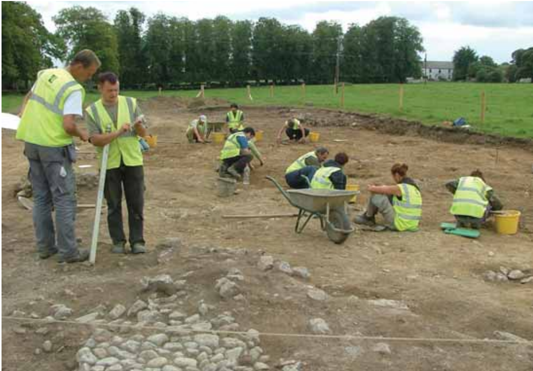
Illus. 3—Danesfort 4 under excavation, with the 19th-century farmhouse in the background. Danesfort House was located approximately to the right of the farmhouse, where the vegetation is growing. The avenue of lime trees to the left of the farmhouse leads to the Kilkenny–Waterford road.