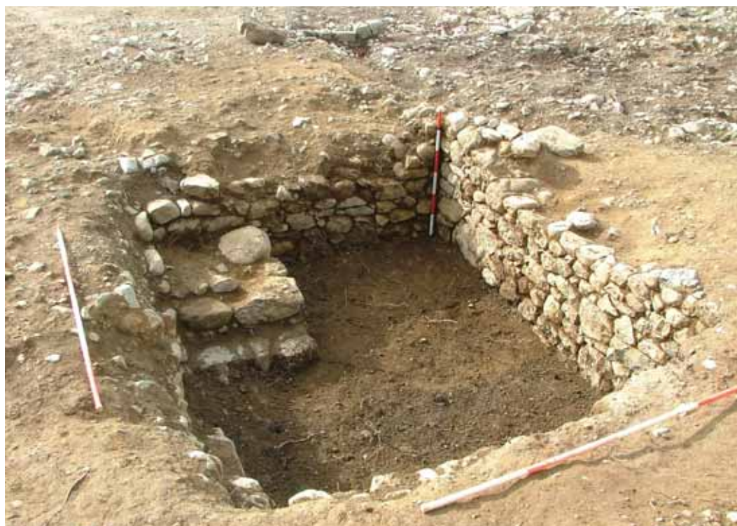
Illus. 7—A view of the cellar during excavation, from the east (Richard Jennings).

a series of domestic or semi-industrial features were built, including a small limekiln, two ovens, one of which had undergone design modifications, some pits, one of which was stone-lined, and a rotary quern-stone (Illus. 8). A yard area with structural remnants made up of two patches of cobbling and fragmentary stone walls was laid out to the south of this area. The limekiln may have provided the lime mortar used in the construction of the ovens. It was unlikely to have been used for the production of fertiliser for agriculture because of its small size. The main clue linking this development to the mid-late 18th century was the presence of handmade red bricks and the production of lime on the site, both of which became more prevalent in Ireland in the early years of the industrial revolution. An entry in Finn's Leinster Journal records the death of a person from lime fumes on the estate in 1774 (cited in Law 2008). Accompanying these features were red burnished wares and clay pipes, find types that fit within this chronological time-frame. This is further reaffirmed by the absence of stoneware and tin-glazed pottery sherds, which are indicators of 17th-century habitation.