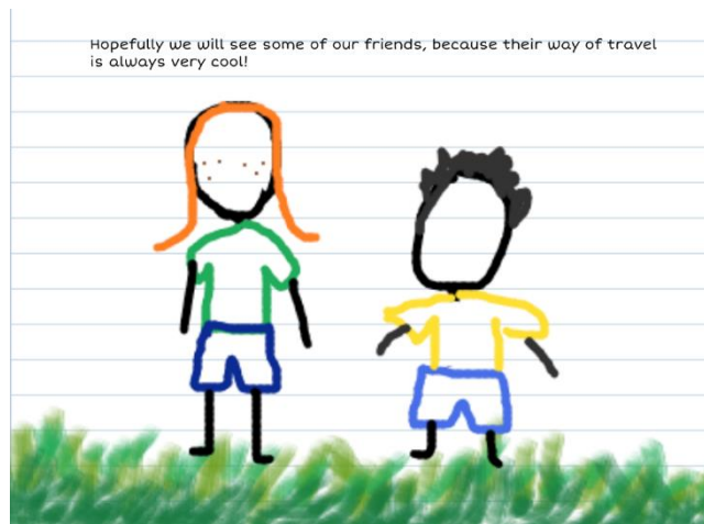
Figure 7: Illustration from Student e-book Our Journey to School

In this modern world where stereotypes rage within the media, it is important that the book underlies the idea of inclusion. The book was created to allow children from all backgrounds to be able to relate to either a character or a theme, furthermore, enhancing a child's self-esteem as it links to one of the three pillars for sustainable development, social equality, as they will feel accepted by society. (Student comment from rationale)