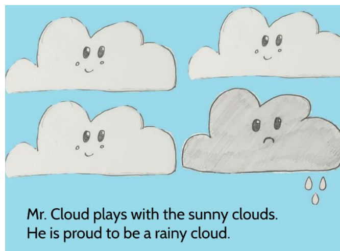
Figure 5: Illustration from Student e-book Mr Cloud