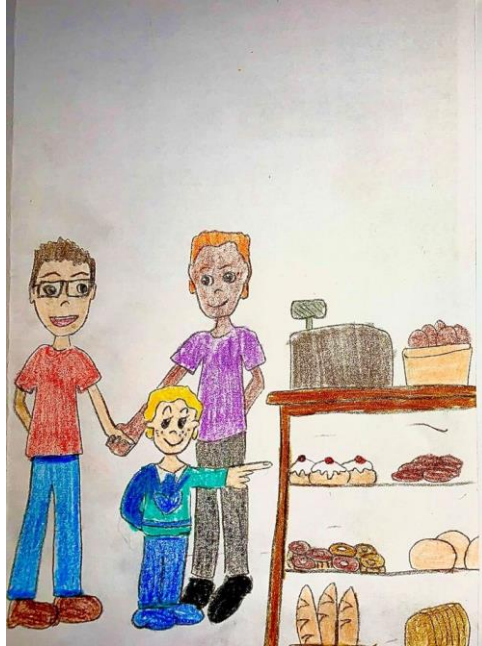
Figure 4: Illustration from Student e-book Maisie's Adventure

The student author of Maisie's Adventure promotes a dialogic view of learning and young children as capable and sophisticated language users, who are able to shape others in the same way they are shaped through dialogue themselves (White, 2017). This suggestion of agency reflects the idea of “children as peers instead of inferiors” (Medress, 2008, p. 23). Much emphasis is placed on dialogue in early childhood education, not least the pedagogy of listening as embedded in the highly regarded Reggio Emilia education approach (Rinaldi, 2006). In addition, the promotion of sustained shared thinking within the UK English Early Years Foundation Stage (English Department for Education (DfE), 2017) is an effective pedagogical strategy to establish intersubjectivity or what Oates and Grayson (2004, p. 56) frame as “a meeting of minds”.