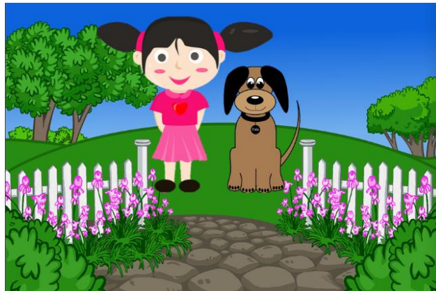
Figure 1: Illustration from Student e-book Fido's First Day Out

As evident from the excerpts above, students particularly celebrated the use of bright colours for children. This was readily witnessed in the e-books, as depicted in Figure 1: