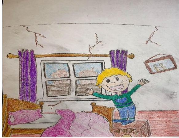
Figure 2: Illustration from Student e-book Maisie's Adventure