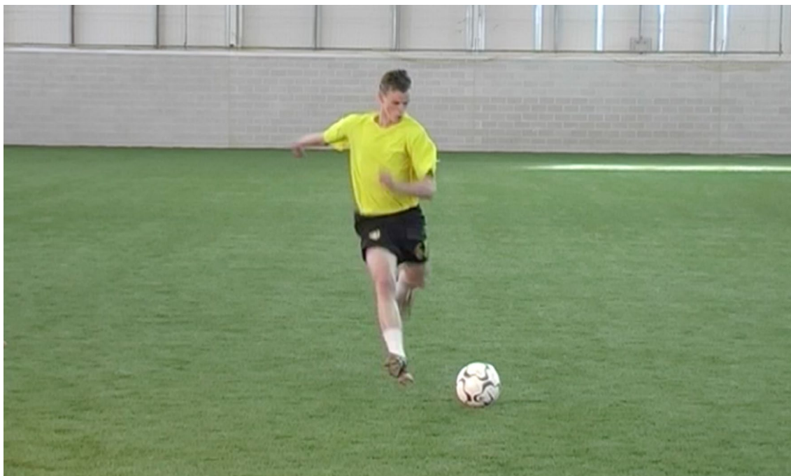
Fig. 2 Example of a frame from the video-based anticipation test of the penalty-kick scenario, which demonstrates the perspective of the participant

During this time, participants were required to confirm the destination of the ball and thus the direction of travel to save/defend the penalty based on four options (top left, bottom left, top right, bottom right; Fig. 1). Participants were instructed to select their response as quickly as they could, to closely replicate the requirements of the task, yet the time taken to select their response was not recorded. The destination of the ball always contained one of these options and all shots were ‘on target’ whereby they would hit the net of the goal. There was a 25% chance that the participants would ‘guess’ the correct response. Participants completed 5 familiarisation trials (no feedback was provided to replicate the task) and 20 experimental trials. There was no repetition of trials within the experiment. All sessions were completed in approximately 15 min. The order of the presentation clips remained constant across all participants.